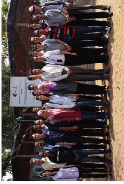
PETRONAS Penapisan (Melaka) Sdn Bhd Technical Visit