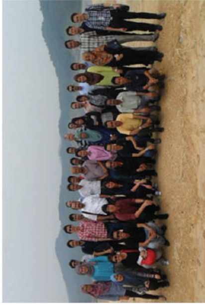
Bukit Tagar Sanitary Landfill Technical Visit