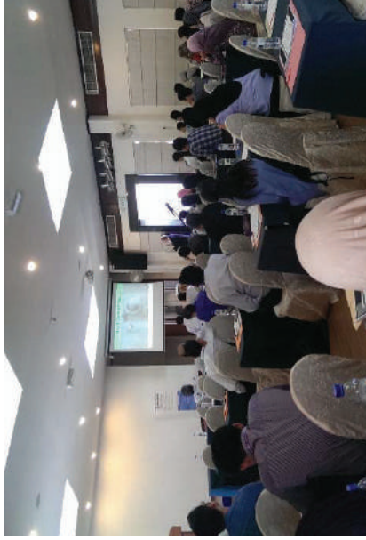
Forum on Environmental Management 2014 (FEM2014)