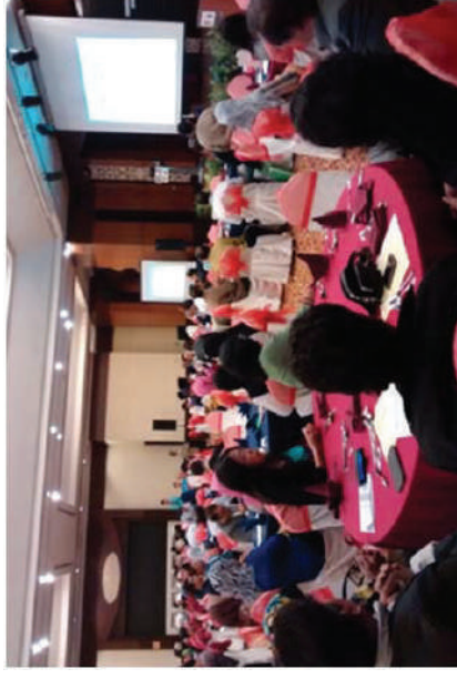
“ Program ‘Engagement’ Rakan Alam Sekitar bersama Rakan Strategik Jabatan Alam Sekitar dan Pihak Industri”