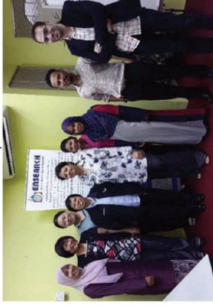
Introduction to Sustainability Reporting and Global Reporting Initiative G4 Guidelines Training