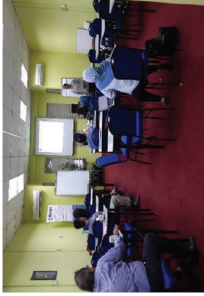
Why You Can't Ignore ISO14001:2015 Training