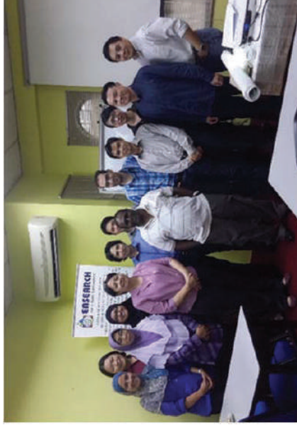
Introduction to Introduction to Corporate Carbon Footprint Training