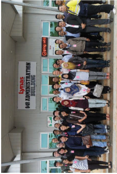
LYNAS Technical Visit Group Photo