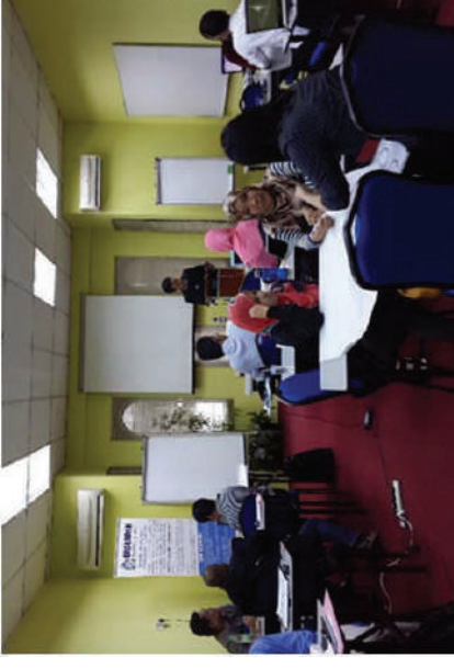
GIS Application in Environmental Management Training