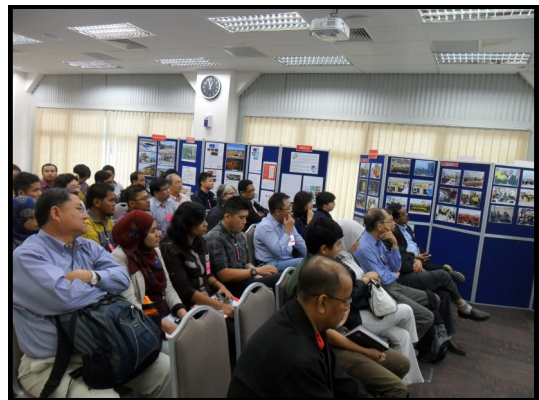
Participants during the presentation given by LYNAS technical team.