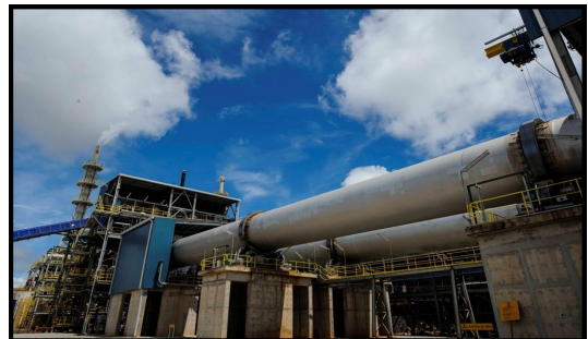
Rotary Kiln 's are used in a section of the process to remove and separate certain elements in the material.