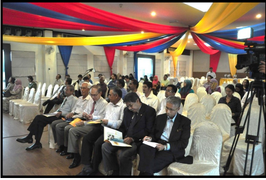
KKEF Memorial Public Lecture and Young Environmental Internship Award at Kelab Golf Negara Subang, 9th January 2014.