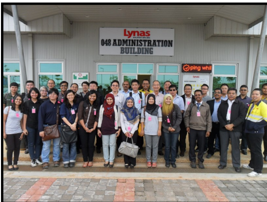
Group photo taken in front of LYNAS Administration Building.