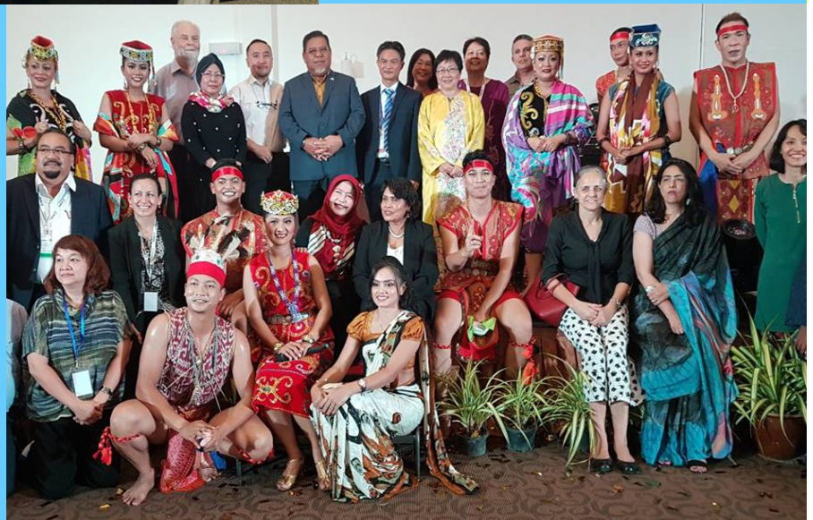
Group Photograph - 13th APRSCP Cocktail Dinner which had a vibrant Cultural Dance Performance