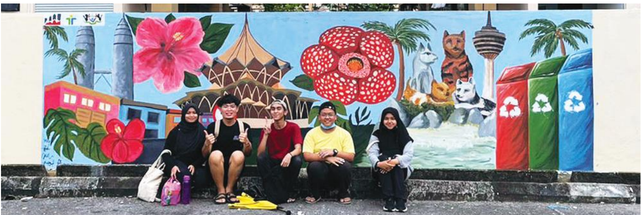
Champion Team Fiasco with their winning design.

The wall mural competition was open to individuals, local artists, college and university students aged 18 years and above, who could enter as an individual or as a group of up to five people. Meanwhile, the jury panel comprised of arts and design experts from Universiti Malaysia Sarawak (UNIMAS), Swinburne University of Technology (Sarawak Campus) and Artsy Daphy Enterprise.