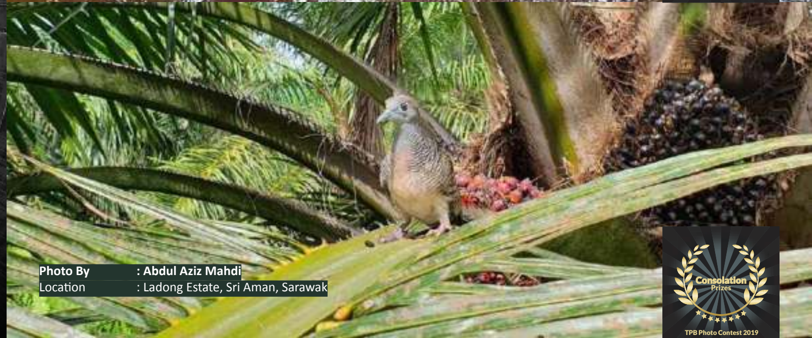
Location : Ladong Estate, Sri Aman, Sarawak