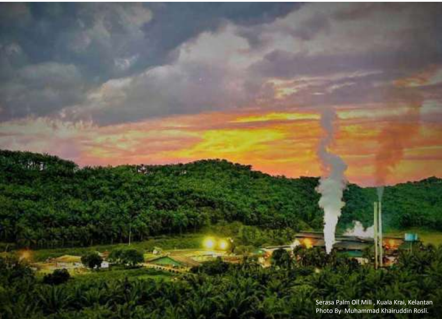
Serasa Palm Oil Mill, Kuala Krai, Kelantan

We've got some inside scoop from some mill engineers from several mills across Peninsular and East Malaysia on the what- nots of the engineering universe. Let's hear what our mill engineers have to say about their ever-so-challenging lifestyle.