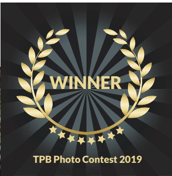
Location : Rasau Estate, Sibul, Sarawak