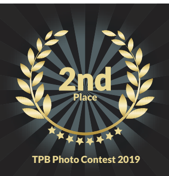
Location : Trusan Palm Oil Mill, Lawas, Sarawak