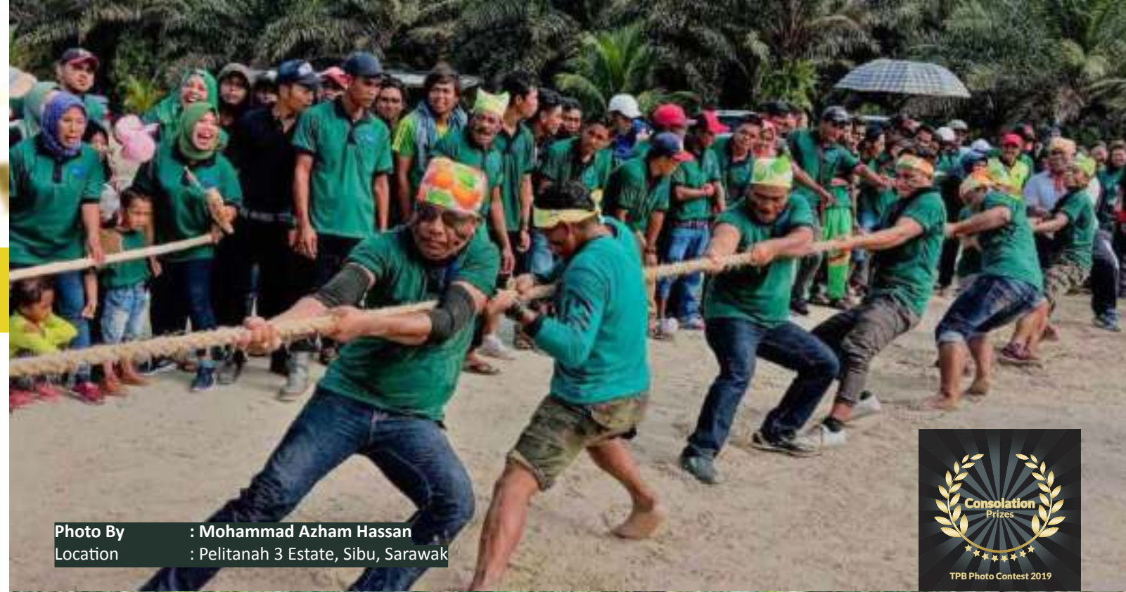
Location : Pelitanah 3 Estate, Sibul, Sarawak