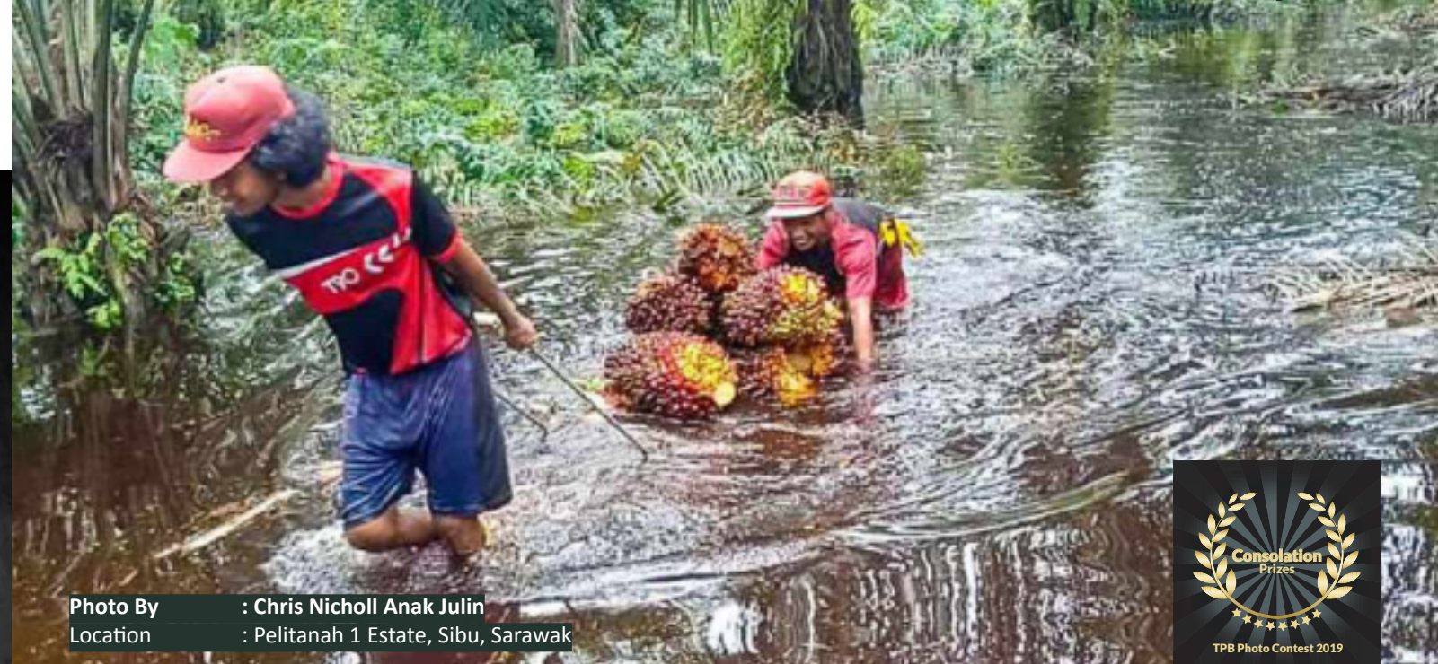
Location : Pelitanah 1 Estate, Sibul, Sarawak