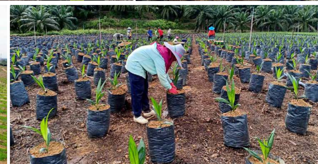
LOCATION: Replanting exercise at Binu Estate