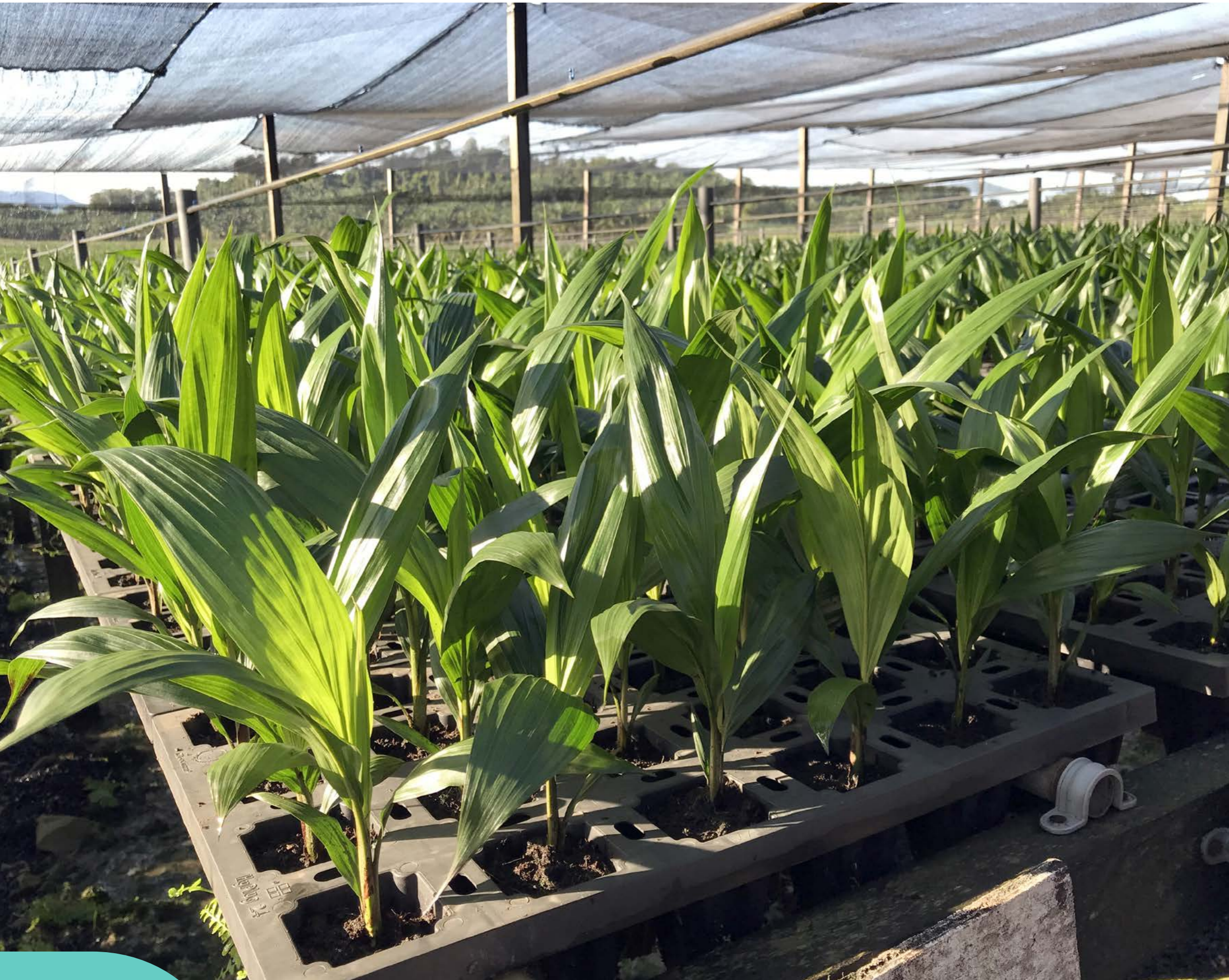
A green sanctuary at Trusan Estate's nursery. Location : Lawas Sarawak