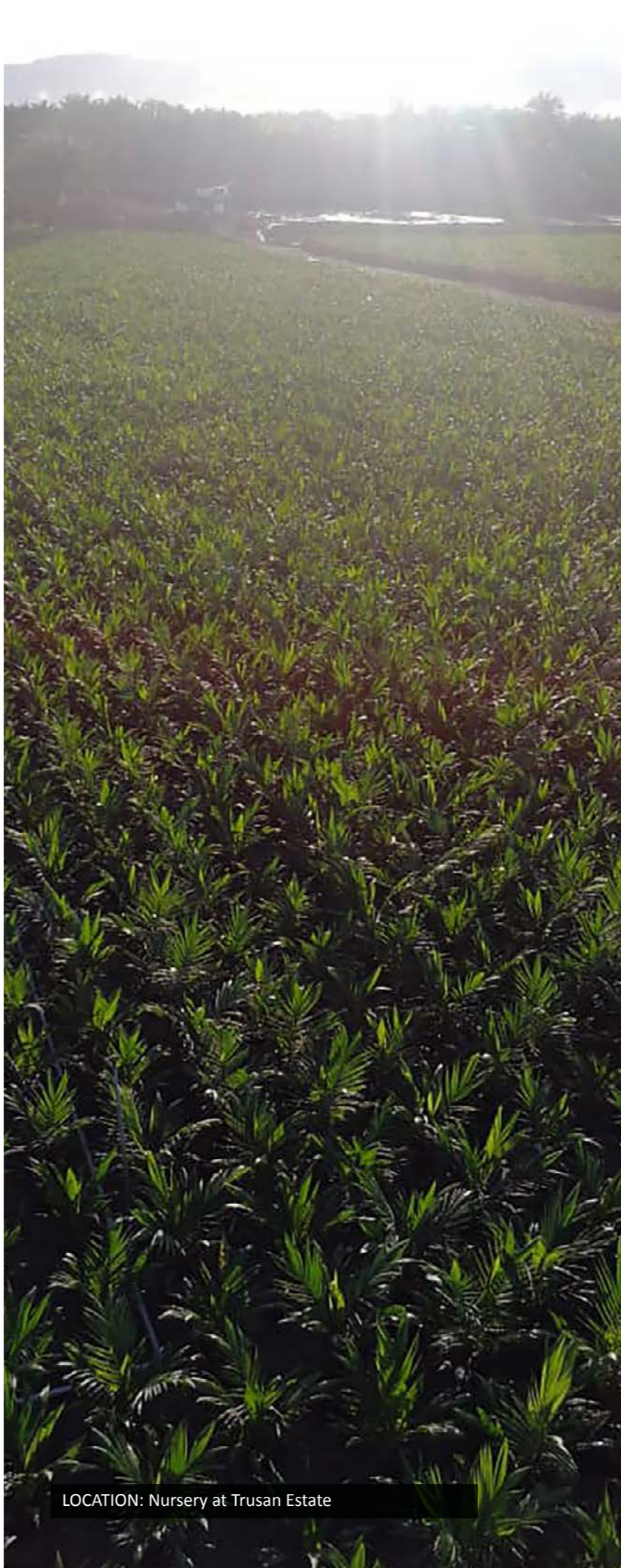
LOCATION: Nursery at Trusan Estate