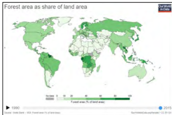
Figure 1. Percentage of land area under forest

Greenpeace, a non-governmental organisation, started in 1971 by a small group of activists from Canada, is one of those voices. They are best represented by their boat called the Rainbow Warrior (Picture). Their vision was to realise a green and peaceful world. On the 29th July this year, they now have an office in Malaysia. This is the fourth office in Southeast Asia after Philippines, Thailand and Indonesia.