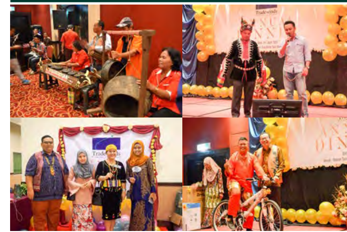
2 April | SBU Miri | Eastwood Valley Golf & Country Resort