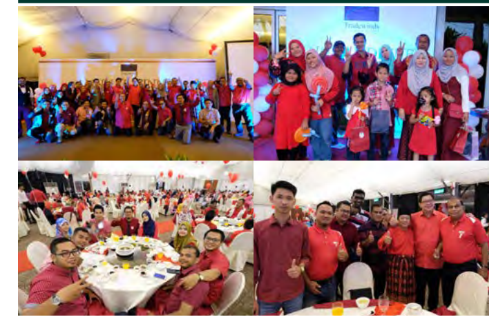
22 April | SBU Sibul, SBU Mukah, SBU Mato Daro / Kingwood Hotel