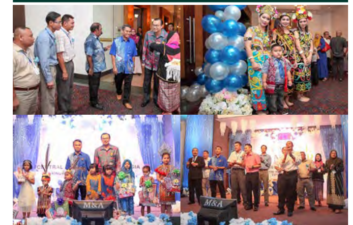
23 April | SBU Kuching, SBU Sri Aman | Grand Margherita Hotel