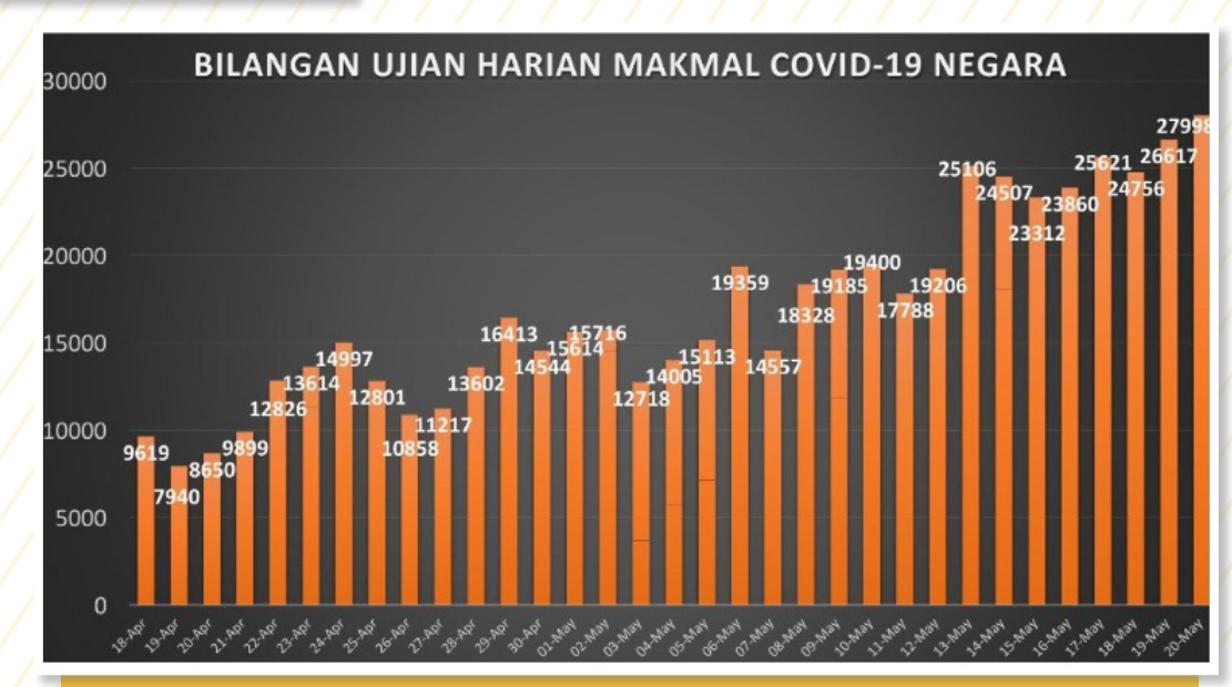
The national diagnostic capacity for COVID-19 was significantly increased to 28 thousand tests daily from April to May 2020, after the intensive training provided by IMR to other laboratories since January 2020

In addition, as of 27th May 2020, the COVID-19 testing capacity in Malaysia stands at 28 thousand tests per day.