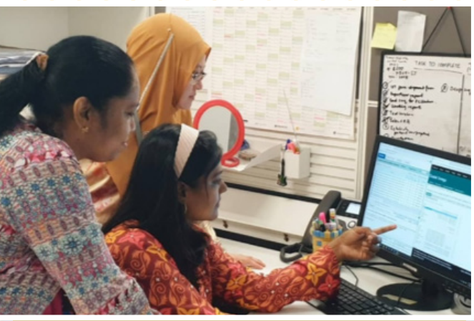
Officers testing and validating the appropriate DNA sequencing for the "primers and probes" specific for COVID-19.