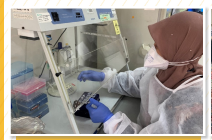
IMR Virology Officer conducting Real time RT-PCR Optimization Test for COVID-19.

The optimization of the real time RT-PCR was subsequently carried out and the testing reagents were provided to the National Public Health Laboratory (MKAK) Sungai Buloh to commence diagnostic testing for COVID-19 from 24th January 2020. Subsequently on 25 January 2020, IMR reported the first laboratory confirmed case of COVID-19 in Malaysia.