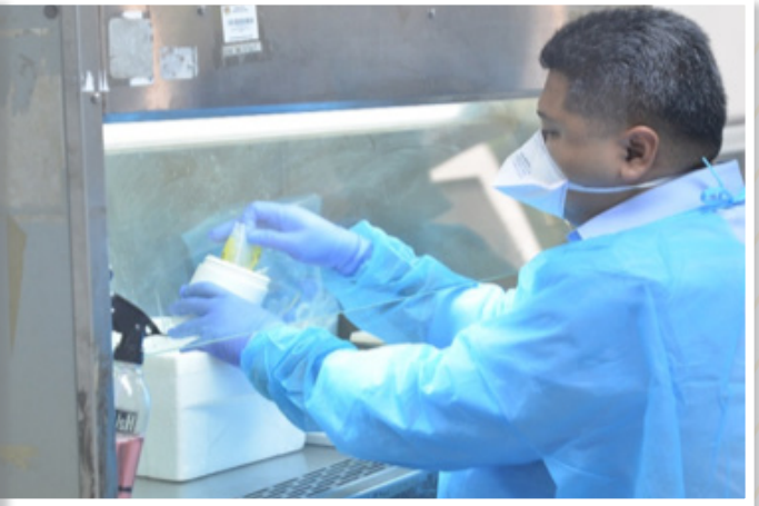
Strict infection control guidelines were adhered by all laboratory personnel, who had completed competency in Personal Protective Equipment (PPE) usage in the COVID-19 laboratory tests.