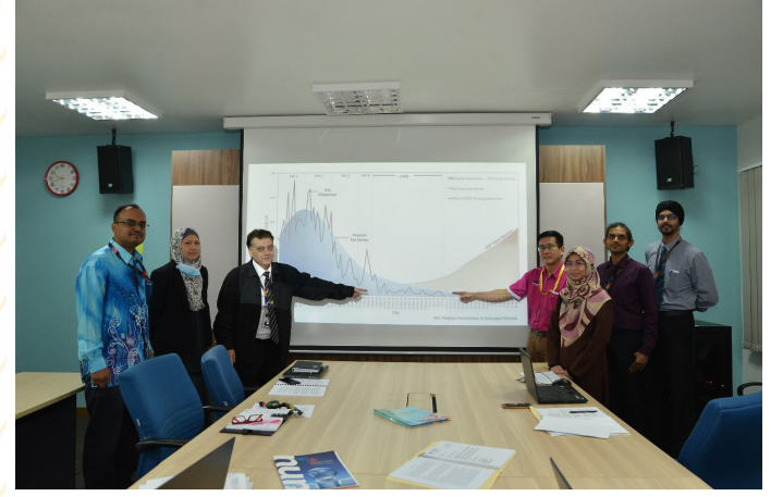
The COVID-19 Modelling predictions are employed to project the distribution of cases in the future. "Flattening the Curve" has shown the reduction in the number of cases which allows the healthcare services to better cope with the pandemic