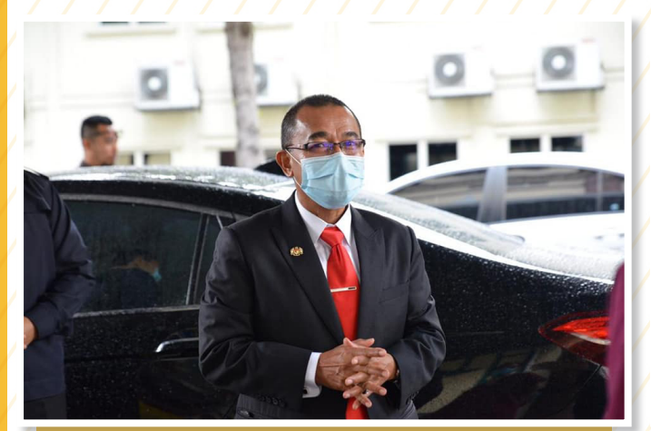
YB Deputy Minister of Health arriving at IMR

The Deputy Minister of Health Malaysia, YB Dato' Haji Dr Noor Azmi Ghazali conducted a visit to the COVID-19 laboratory, IMR Jalan Pahang during fasting month on 4th May 2020. This meaningful visit was part of the "Program YBTMK Menyantuni Petugas Barisan Hadapan IJN, HKL & IMR", in recognition and appreciation for all healthcare front liners involved in COVID-19 response. The COVID-19 pandemic has caused significant pressure on the healthcare system, nevertheless, our frontlines healthcare workers has shown extreme resilience by continuing to devote their efforts to contain this pandemic. We are humbled by their immense commitment, invaluable dedication and unwavering focus in the fight against the COVID-19 pandemic, and at times risking their own lives for the health of the nation.