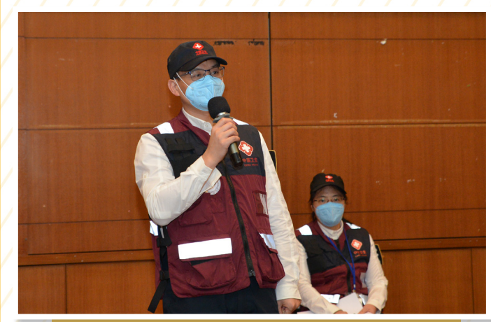
The medical experts responding to the questions raised during the dialogue session.