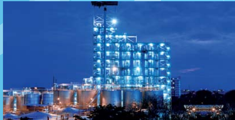
The state-of-the-art IOI Oleochemical plant in Penang is committed to energy and water conservation.