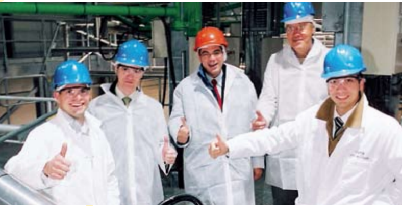
Success is a great source of motivation for further achievements.

In addition, IOI has implemented various ongoing programmes that emphasise on the human capital development of the organisation and benefit the staff of IOI such as management trainee programmes, internships and scholarships for selected IOI staff.