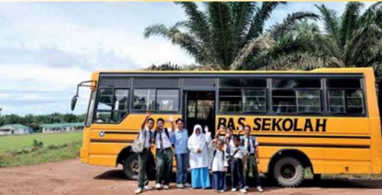
School bus to bring children of estate workers to schools.