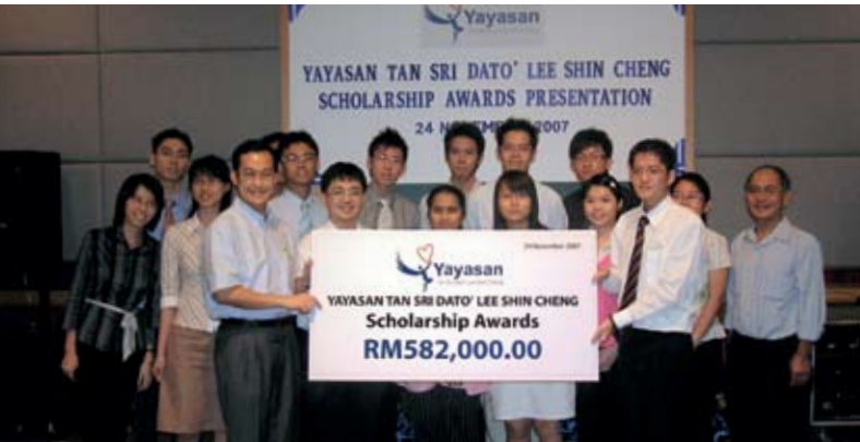
RM582,000 of scholarships were awarded to 17 students in 2007.

For a start, 262 students from poor families and spread across 58 primary and 20 secondary schools in Peninsular Malaysia and Sabah have been selected to receive RM800 and a school bag each year until he or she completes primary or secondary education. About 2000 children from HUMANA kindergartens in IOI's oil palm estates in Sabah also benefited from this programme.