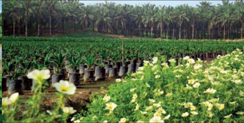
These beneficial plants are a biological means to attract natural predators.

To ensure efficient, successful and sustainable cultivation, it is absolutely necessary to control pests, rodents and plant disease. Our primary means of doing so is by following an Integrated Pest Management policy.