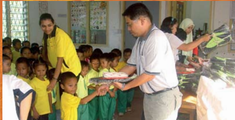
Ulu Estate Manager presenting school bag and stationery to one of the Humana students.