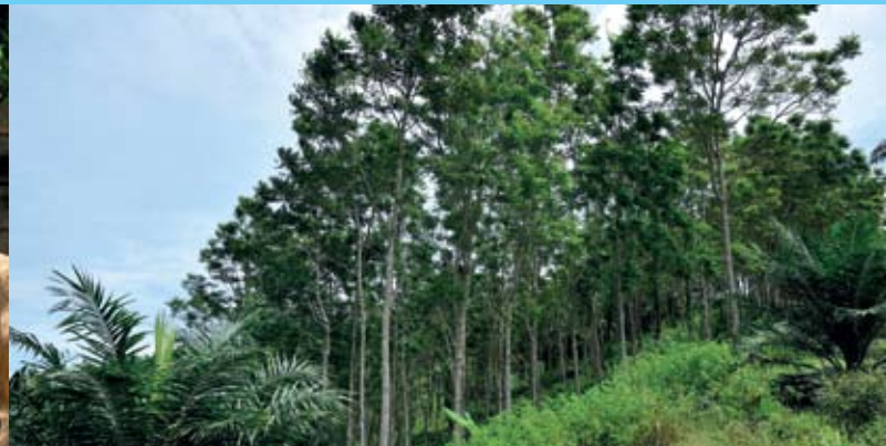
Riparian reserves serve as a habitat for the wildlife.

In order to maintain the biological balance within the plantations, all steep, unplanted tracts of land are purposely left in wilderness condition to allow indigenous insects, plants and wildlife to continue flourishing in and around the plantations. We also link riparian reserves and other reserve areas within estates and surrounding neighbourhoods to form corridors and refuges for wildlife.