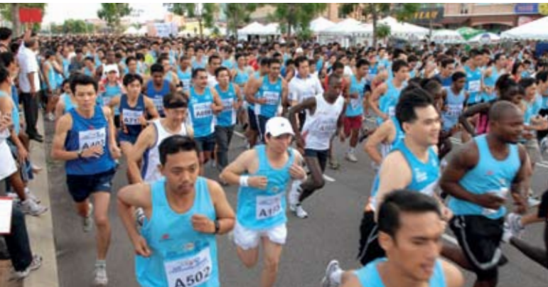
Enthusiastic runners at the flag-off of the IOI Community Run.