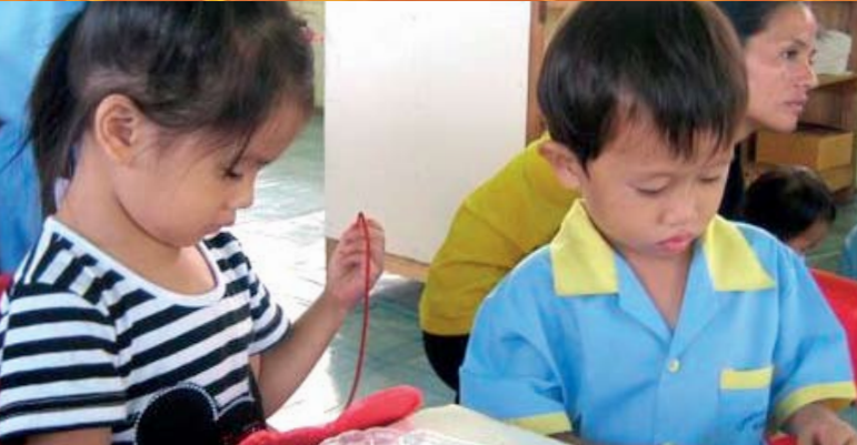
The Learning Centre provides the native children from Sarawak with their first exposure to basic education.

Yayasan is funding the Lawas Project for the curriculum infrastructure development of the ethnic Lumbawang community in Sarawak to realise the short-term vision of raising competent native-speaking teachers and the long-term vision of building a training and research centre for ethnic pre-school training in Sarawak.