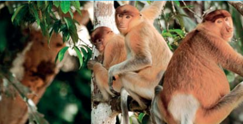
IOI's sanctuary for proboscis monkeys provide a home for these endangered species.

Care for the environment is a global concern and it is also certainly a key concern for IOI. We believe that the sustainability of our businesses is interdependent with the sustainability of the ecosystem surrounding its operations. Some of the conservation projects undertaken include: