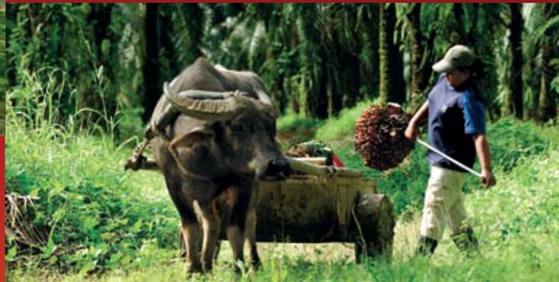
The Buffalo-Assisted Harvesting (BAH) method is employed to reduce energy consumption.

Buffaloes are also used wherever practical instead of fuel-powered vehicles to transport fresh fruit bunches from infields. By using as little fossil fuel as possible, we actively reduce the amount of undesirable emissions, greenhouse gases and pollution that we produce. Furthermore, this approach also causes less soil erosion than working with machines.