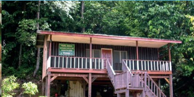
Tourists are able to gain useful information at the Information Centre at Nangoh Estate.