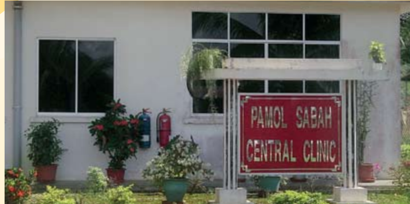
A clinic with adequate facilities.

To maintain cleanliness and hygiene, a Visiting Medical Officer (VMO) visits the labour quarters twice a month whilst frequent health programmes and campaigns on pap smear, breast cancer and other healthcare issues are organised for the workers and local communities.