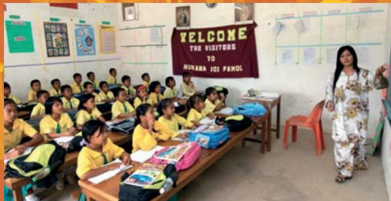
Children at the IOI Pamol Humana Centre.

IOI also sponsored computers, projectors and sound system for some selected learning centres. Today, IOI is the main contributor which sponsors over 20 of these learning centres in Sabah that benefit more than 2000 children.