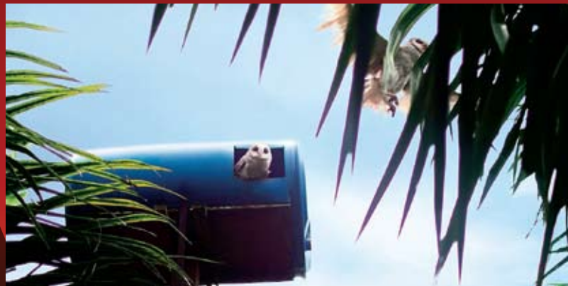
Barn owls are an environmentally-friendly and cost-effective way to control rats.

Biological control is integrated into pest management practices to minimise usage of pesticides. Beneficial plants (e.g. Casensia cobanensis and Tunera spp. ) are planted to attract natural predators for biological control of bagworms and other leaf-eating caterpillars which are major insect pests in oil palm plantations.