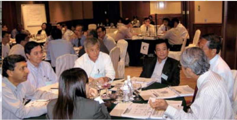
A workshop in session on strategy formulation and implementation of the best practices.

Although diverse in race, gender or nationality, our employees are given