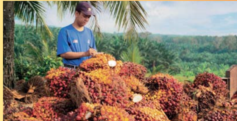
Only the best fresh fruit bunches (FFB) are selected.

To sustain our growth in land productivity, our Research Centre focuses on continuously producing high yielding planting material through plant breeding, biotechnological research and tissue culture. We also ensure long-term sustainability through optimising the use of renewable resources and environmental-friendly agricultural practices. Some of the more significant areas are highlighted below.