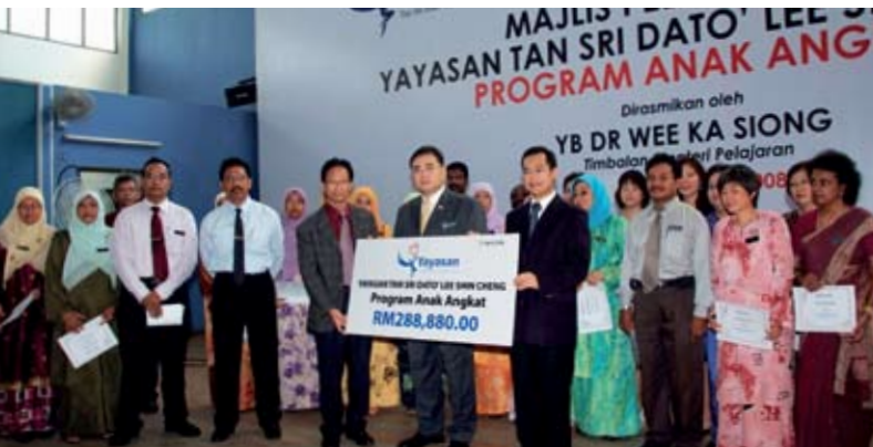
The official launch of the Yayasan TSLSC Student Adoption Programme by YB Dr. Wee Ka Siong.