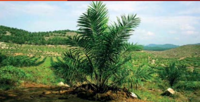
EFB mulching in the inner circle of replants provides palms with initial nutrients.