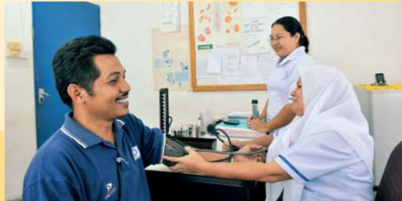
Free medical treatment for the estate workers and neighbouring communities.