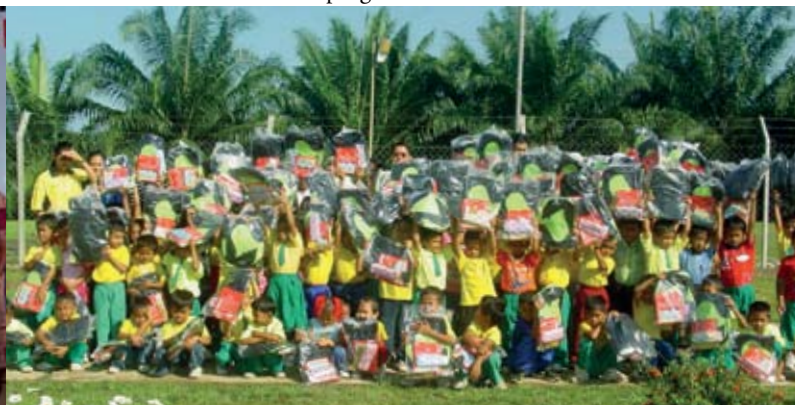
251 adopted students also received school bags and stationery sets at Humana House 101, Ulu Estate.