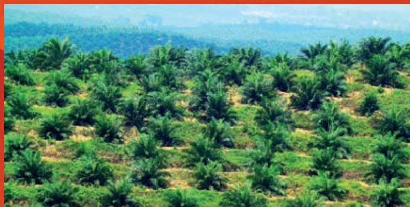
Terracing conserves soil, water and nutrients effectively.

Soil is a living environment that can be depleted or damaged by cultivation. Terracing is carried out in undulating or hilly areas to conserve soil, water and nutrients effectively.