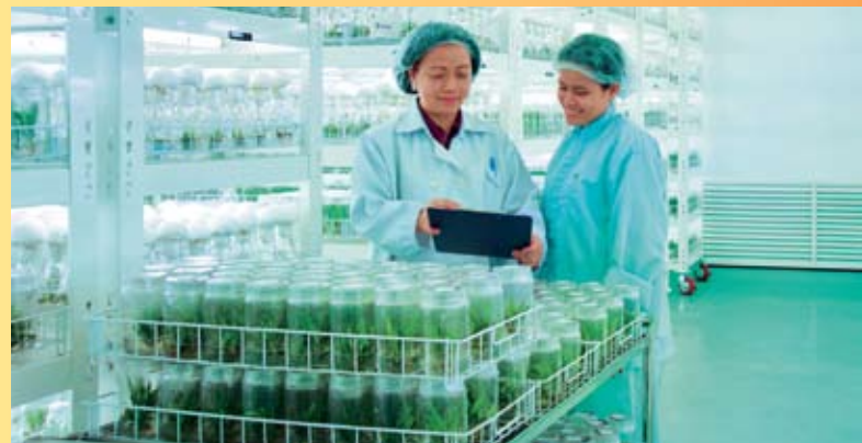
Breeding the best seeds at the tissue culture laboratory.