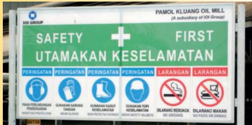
Safety is a priority at all IOI estates.