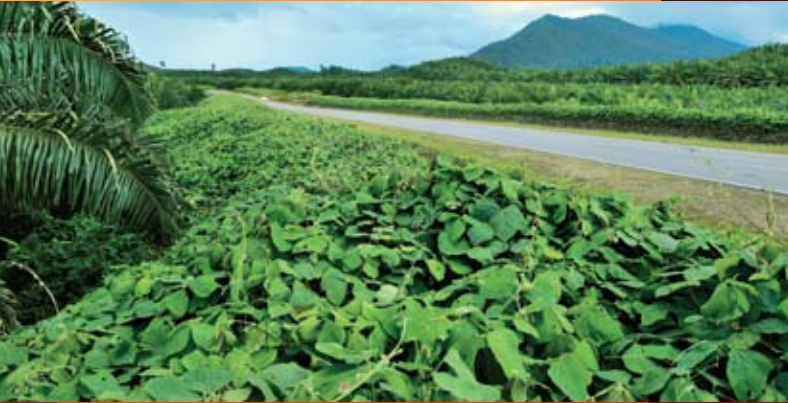
Legume cover crops provide excellent soil coverage.

Legume cover crops (LCC) are established immediately after planting as they offer excellent soil coverage compared to natural ground covers. These plants are also useful in minimising soil erosion, conserving soil moisture and improving soil fertility.