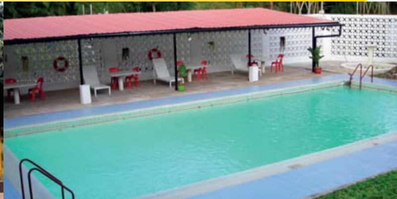
Swimming pool in an estate clubhouse.