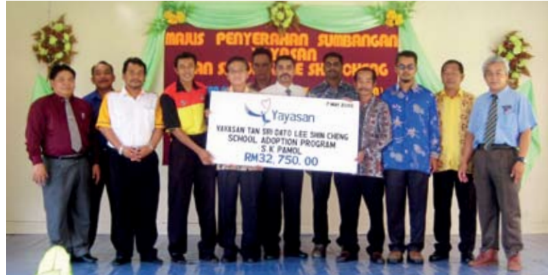
The mock cheque presentation for Yayasan TSLSC School Adoption Programme at SK Pamol Sabah.