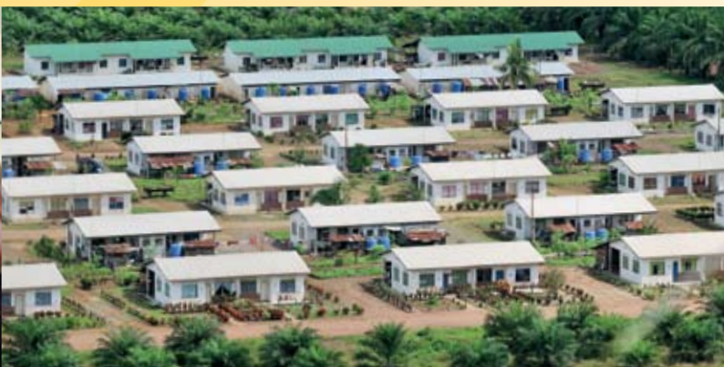
Clean and comfortable housing for workers.