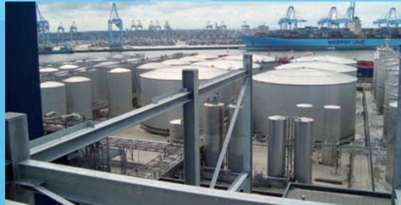
Rotterdam's close location to clients means palm oil is refined only once resulting in less energy, fewer materials and less waste.