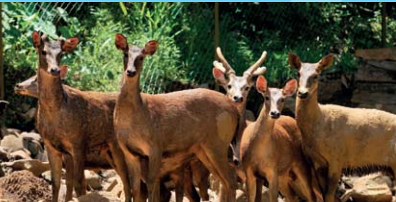
The deer farm at Nangoh Estate is one of the tourists' attraction.