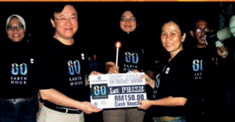
Presenting a souvenir for the Best Energy Saving Idea initiated during Earth Hour.

The green initiative included IOI's leisure and hospitality hotels and malls – Putrajaya Marriott Hotel and Palm Garden Hotel, IOI Mall Puchong, Puteri Mart, IOI Mall Kulai, IOI Mart Kulai; IOI Properties in Puchong and Johor Bahru as well as the refineries and plants – Lodders Crokkaan (Asia, the Netherlands, North America and Canada), IOI Oleochemicals Penang, IOI Edible Oils Sabah, Pan Century (Oleochemical and Edible Oils) which all pledged to unite with the world to join the green movement and slowly learn to adopt the habits of sustainable living in our daily lives.