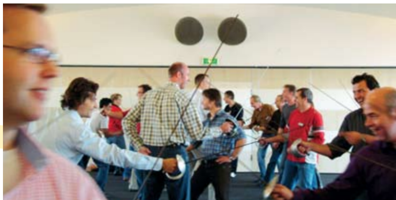
Loders Croklaan's staff receiving a fencing course to know people from a completely different perspective.