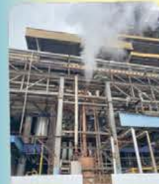
Before the heat recovery project.

Steam flashing is a normal phenomenon of the operations of an oleochemical plant. As water is heated up in boilers to generate steam to heat and operate the system, any excess steam that loses its heating energy and value is discharged into the atmosphere as flash steam. The flash steam is often ignored but it can be recovered for economical and environmental use.