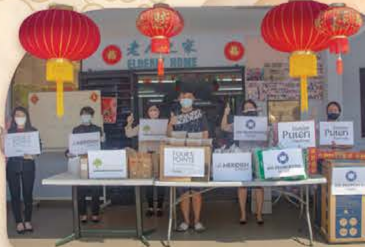
Here's a victory to celebrate against Covid-19!

Though Chinese New Year (CNY) was overshadowed by the Covid-19 pandemic which heightened the feelings of loneliness and isolation, especially among the vulnerable people, we brought the Year of the Tiger with a roaring prosperity of festive joy and gifts to the underprivileged on 20 January 2022 through our Corporate Social Responsibility visits.