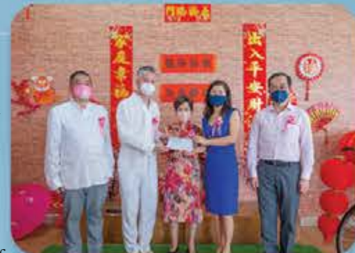
The RM200,000 was donated to the school as an activity and development fund for the progress of the school.