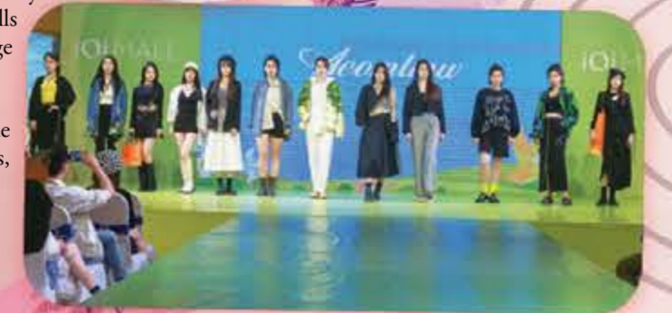
Let us walk the talk at IOI Mall Xiamen and stand up for equality!

Here's to our strong women. Let us continue to build a diverse workplace that inspires, celebrates and values women!