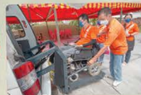
Shuang Fu helps PwDs to achieve an independent life and create an accessible environment for them while giving them a chance to pursue their dreams.