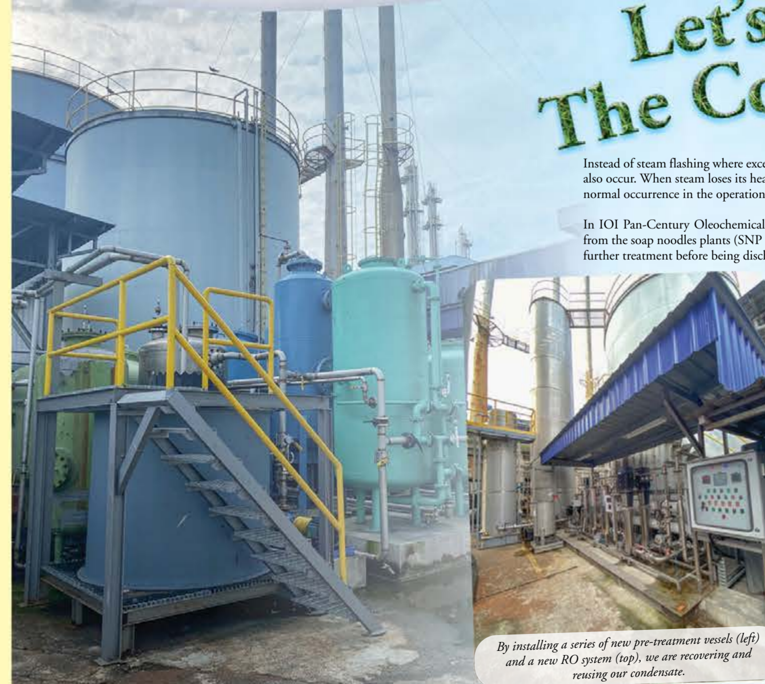
By installing a series of new pre-treatment vessels (left) and a new RO system (top), we are recovering and reusing our condensate.

The project is a green success! In January 2022, our project has reduced the treatment cost and hydraulic load to the ETP. Not only that, it has cut down our water consumption.