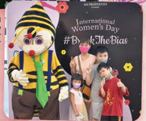
We treated the first 300 Club IOI female members to a lovely muffin each while our Buzzy Bee entertained our shoppers at IOI Mall Kulai.

Our employees and the public had a blast honouring and celebrating the women of their lives in our IOI Sustain and IOI Lifestyle Facebook pages as they posted photos and messages for women at the workplace and in the community in order to promote gender equality. That is how we show our commitment to a more diverse and inclusive workplace and society. A delicious treat for two at Putrajaya Marriott Hotel was up for grabs for the person who crafted the best message of the "Superwoman" in his/her life.