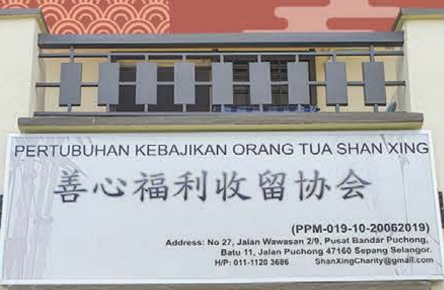
(PPM-019-10-20062019) Address: No 27, Jalan Wawasan 2/9, Pusat Bandar Puchong, Batu 11, Jalan Puchong 47160 Sepang Selangor. H/P: 011-1120 3686 ShanXingCharity@gmail.com

In another event, we also donated a total of RM10,000 to five other charity homes, namely Lotus Hospice Penang, Pertubuhan Penyayang Chi Yun, Bukit Mertajam, Persatuan Orang Pekak Pulau Pinang, Persatuan Kebajikan Shammah Butterworth Pulau Pinang and St. Nicholas' Home, Penang. This fund is aimed to lighten each home's financial burden, especially during this stressful period before the Chinese New Year celebration. Our employees are not forgotten as we continued with our #KitaJagaKita programme to extend financial assistance to our valued employees and their families who are affected by the pandemic.