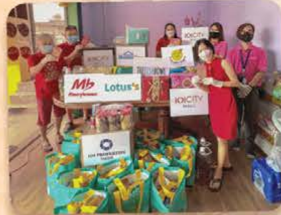
We presented food like yee sang and hot meals as well as essential items like bathing towels to Wan Hing.

Meanwhile, representatives of IOI City Mall (ICM) and IOI Mall Puchong made their first stop to Wan Hing Care Center PSK Sdn Bhd (Wan Hing) followed by the Malaysian Association for The Welfare of Mentally Challenged Children on the same day.