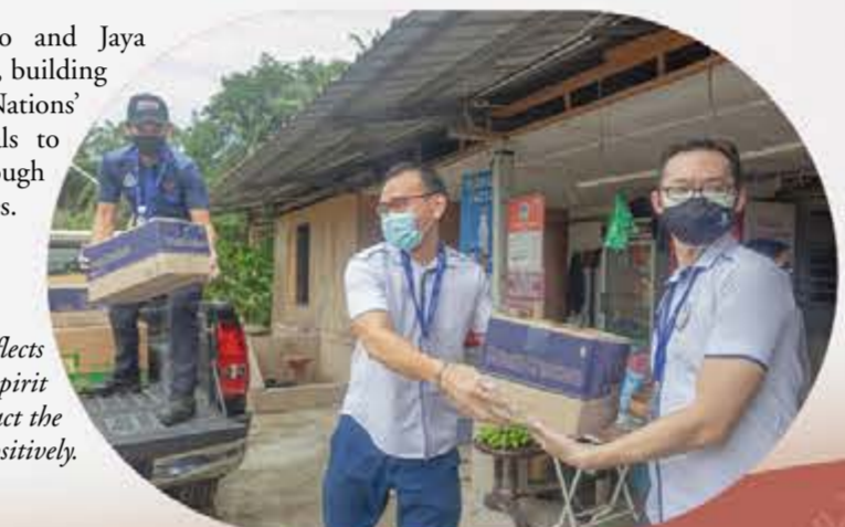
The relief effort reflects IOIPG's communal spirit to continuously impact the community positively.

We partnered with HomePro and Jaya Grocer in this flood relief effort, building upon our belief in the United Nations' Sustainable Development Goals to bring positive impacts through Corporate Social Responsibilities.