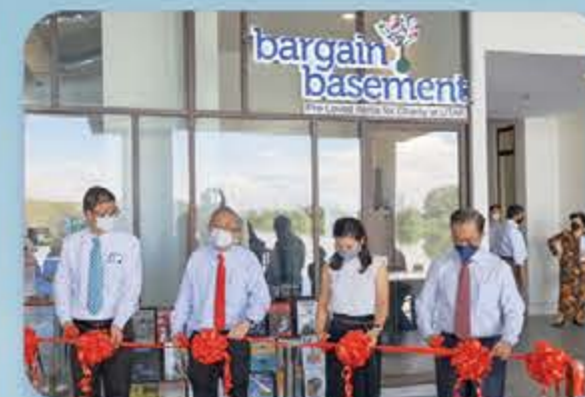
Bargain Basement aims to provide a platform to develop healthy consumer behaviours (one which encompasses good spending and also being environmentally-conscious) while evoking a sense of entrepreneurship and community services among students.