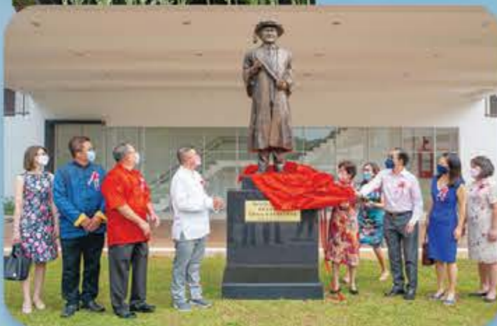
The bronze-made statue of the late Tan Sri Lee was unveiled in the presence of about 40 guests.