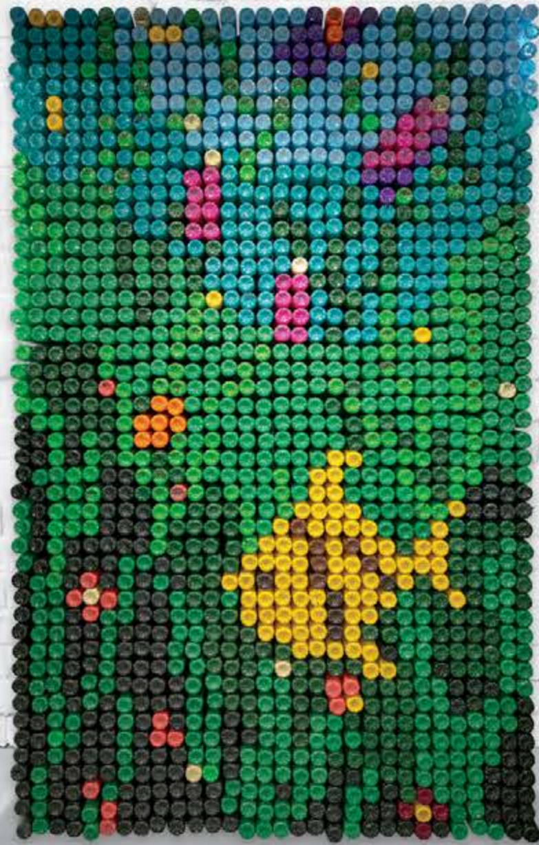
The plastic bottles were cut, painted and arranged into an art piece to depict the wondrous beauty of our underwater world.