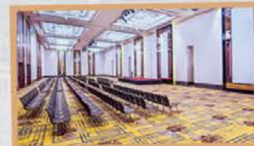
Le Méridien Putrajaya's pillarless Millennium Grand Ballroom caters up to 900 guests and is accompanied by a generous pre-function area of over 1,200 square metres to inspire conferences or events. View further at: https://bit.ly/35xCMx7

Whether it is a gathering of business friends, an elite executive retreat, a product launch, a board meeting or an exhibition fair – from busy conferences to private corporate luncheons, no matter what your meeting size, purpose or event hall choice, the tone for a productive and successful meet is set at Le Méridien Putrajaya and Four Points by Sheraton Puchong, which are certified as the ideal meeting venues for local and international visitors to meet, socialise and celebrate.