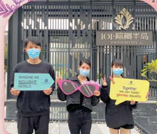
Our colleagues at IOI Palm City Xiamen are equally supportive of International Women's Day.

Over in IOI Palm City in Xiamen, China, our female colleagues also joined the move to celebrate our women workforce by organising a Spring Summer fashion show and a handmade paper flower workshop, among others.