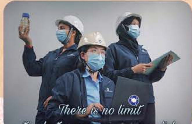
IOI Oleochemical Industries Berhad

As part of the IWD celebration, we also introduced the Women and Digitalisation social initiative, which is related to our Climate Change Action Initiative , in order to encourage our women employees to embrace the digital revolution, and learn to conduct online transactions and do online banking easily, safely and conveniently from their homes.