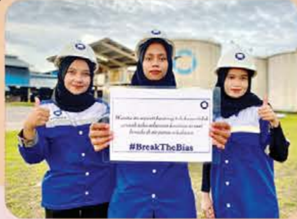
PT Sinar Nabati Agro (PT SNA), Indonesia

Not only that, we have many accomplished and successful women within our Group. Presently 55% of our women are holding management portfolios at the corporate level. Our number of women employees and the roles of women in every tier of employment have continually increased over the years. Our Women Empowerment Committee, which we initiated two years ago during IWD, has not stopped protecting women's rights and introducing various initiatives, specifically during the Covid-19 pandemic. The Face Mask Initiative and Haircut Initiative gave many an alternate source of income.