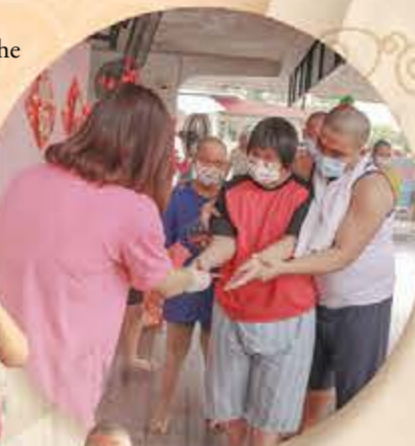
Let the children celebrate the CNY with angpous , new clothes and a scrumptious feast.

CNY seems like the happiest day for the special needs children at the Malaysian Association for The Welfare of Mentally Challenged Children as they feasted on yummy burgers and Coke, courtesy of Marrybrown, and eagerly received angpous on top of new clothes. The home, which is located in Petaling Jaya in Selangor, now has 72 special needs children who suffer from intellectual disabilities (most of them are severely-ill patients). Before we left, we also presented a cash donation of RM3,000 to the caretaker.