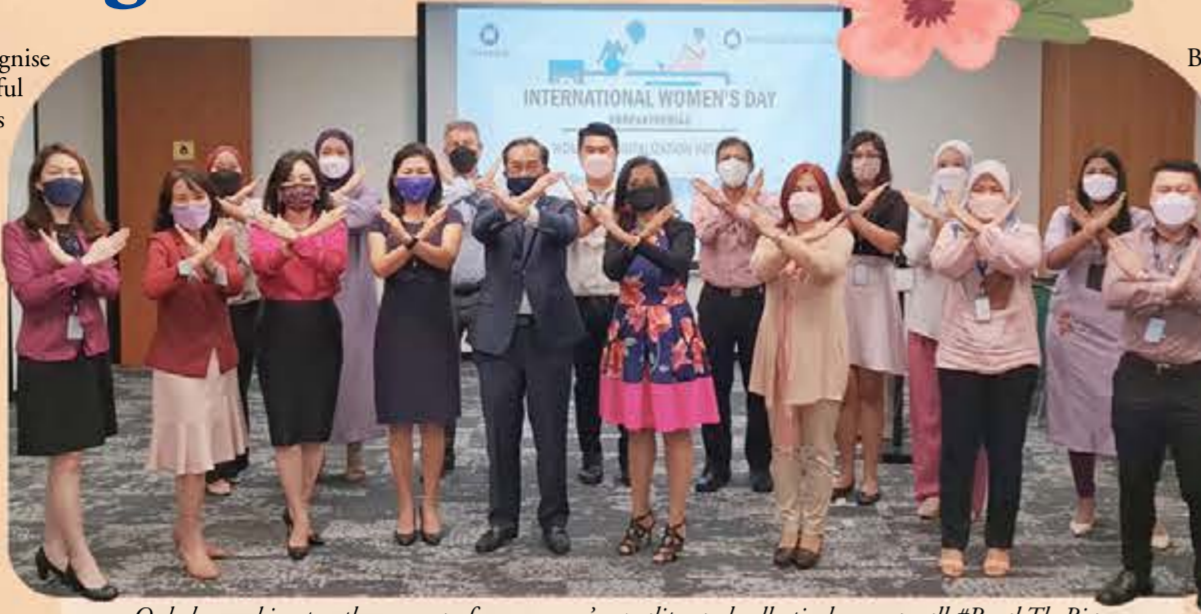
Only by working together, we can forge women's equality, and collectively we can all #BreakTheBias.