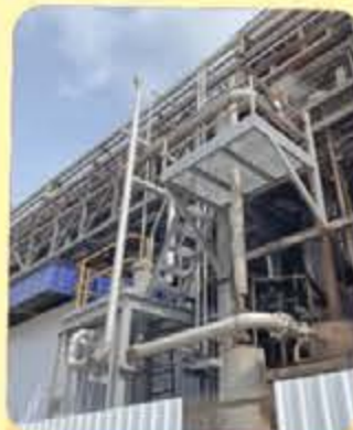
After the heat recovery project.

We successfully commissioned this project in January 2022 and have reduced our steam consumption at the deaerator by three tonnes a day, which is about 15% of the previous consumption, as well as reduced our carbon emissions.