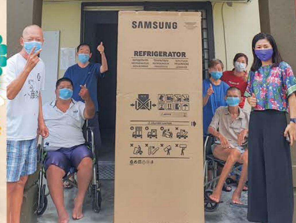
Thank you, Yayasan TSLSC for answering our wish list!