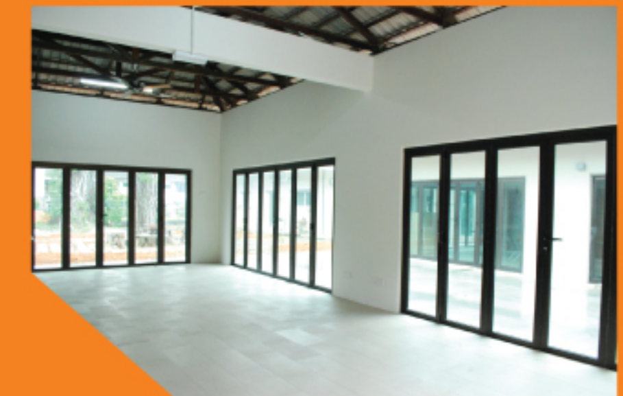
Venue Hire for Parties & other special occasions