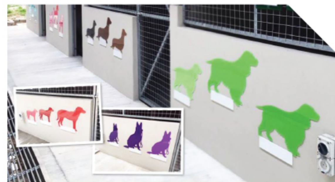
Annual Kennel Sponsorship