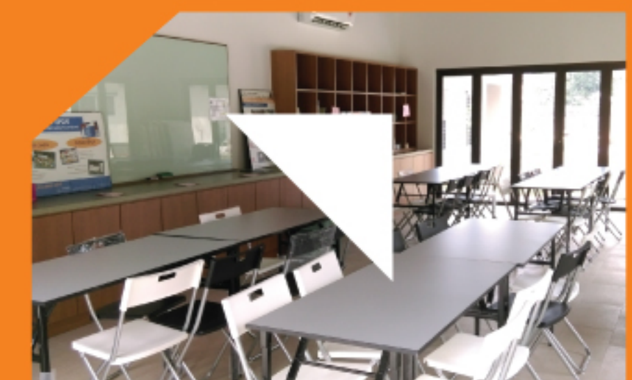
Run corporate workshops / seminars