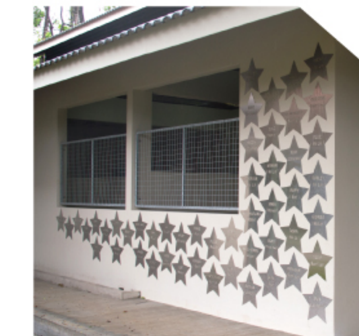
Stars of Fame Wall