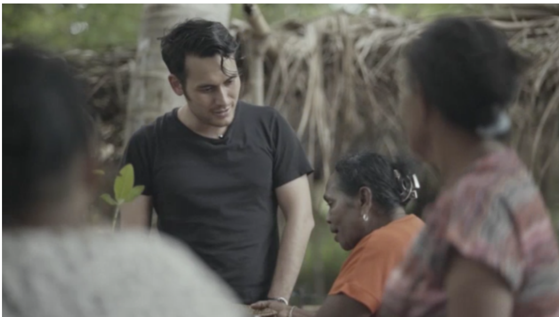
Arifin Putra endorses the Dugong & Seagrass Conservation Project