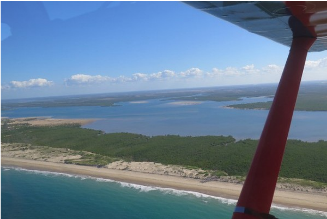
View from 500m of Bazaruto, Mozambique