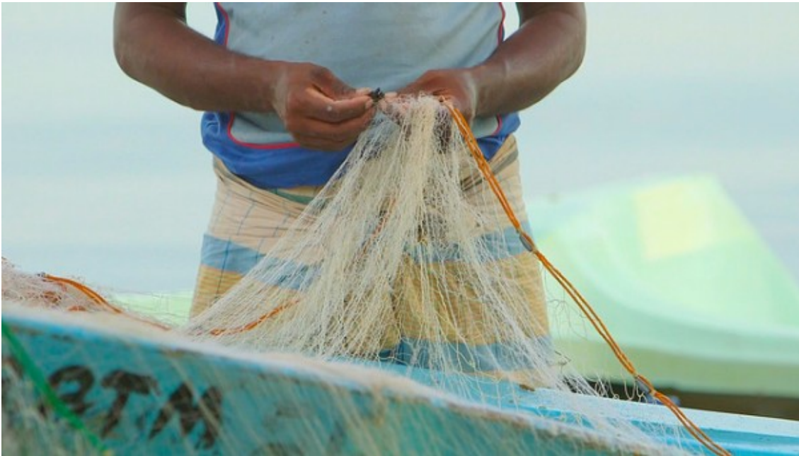
Net mending in Sri Lanka

A survey organized by the IUCN found that fishermen in Northern Sri Lanka believe in the importance of regulation and many are concerned that marine resources will decline if nothing is done. Read the full results.