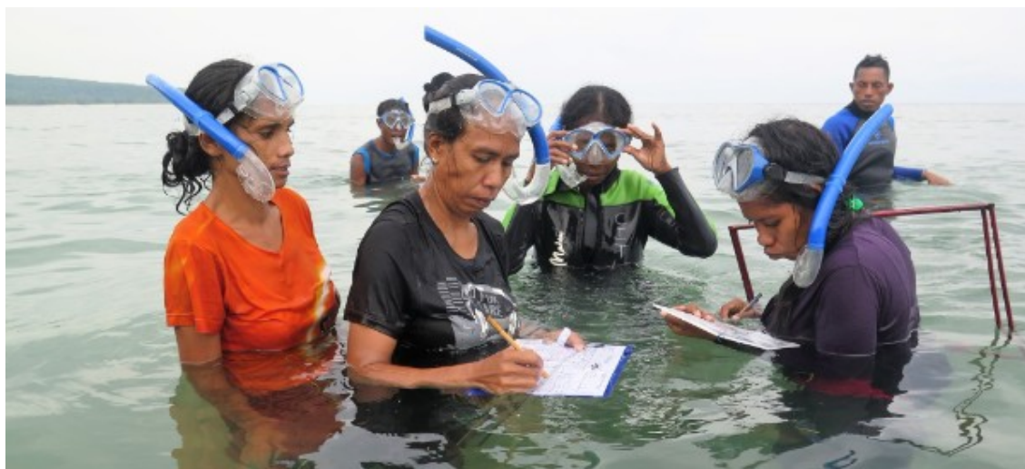
Community-based marine protected areas in Timor-Leste