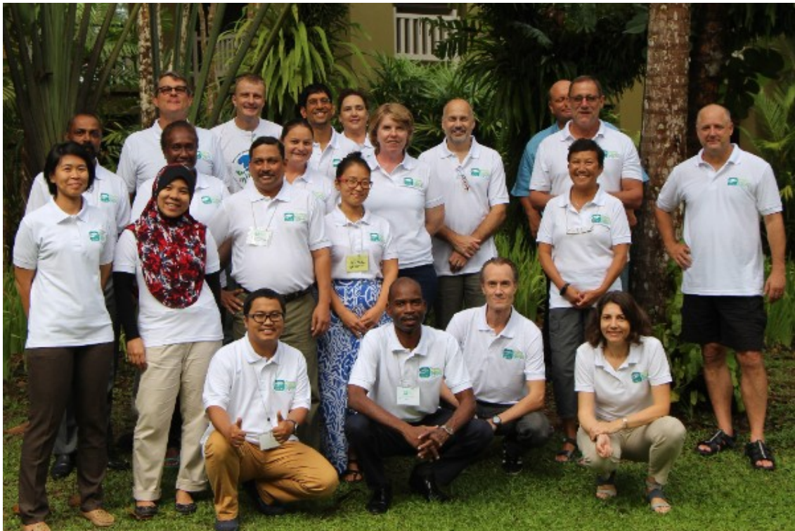
Participants in the Third Executive Project Steering Committee in Trang Thailand

In November we organized the Third Executive Project Steering Committee Meeting in Trang, Thailand. What a beautiful destination! Download the presentations here.