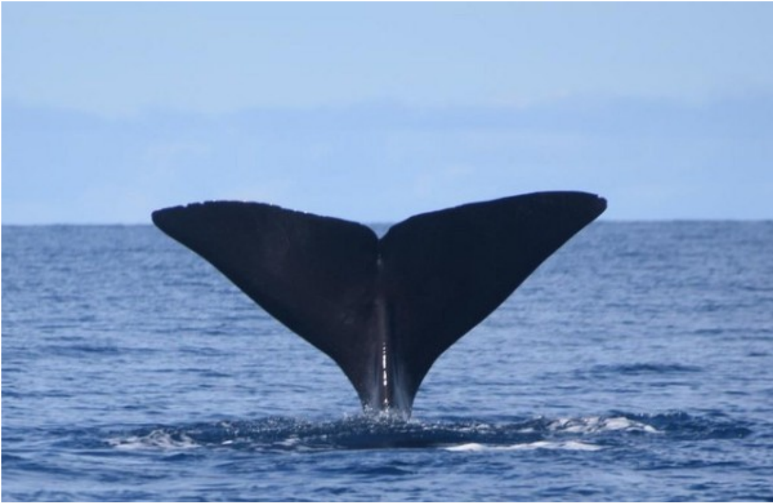
A sperm whale shows its tail