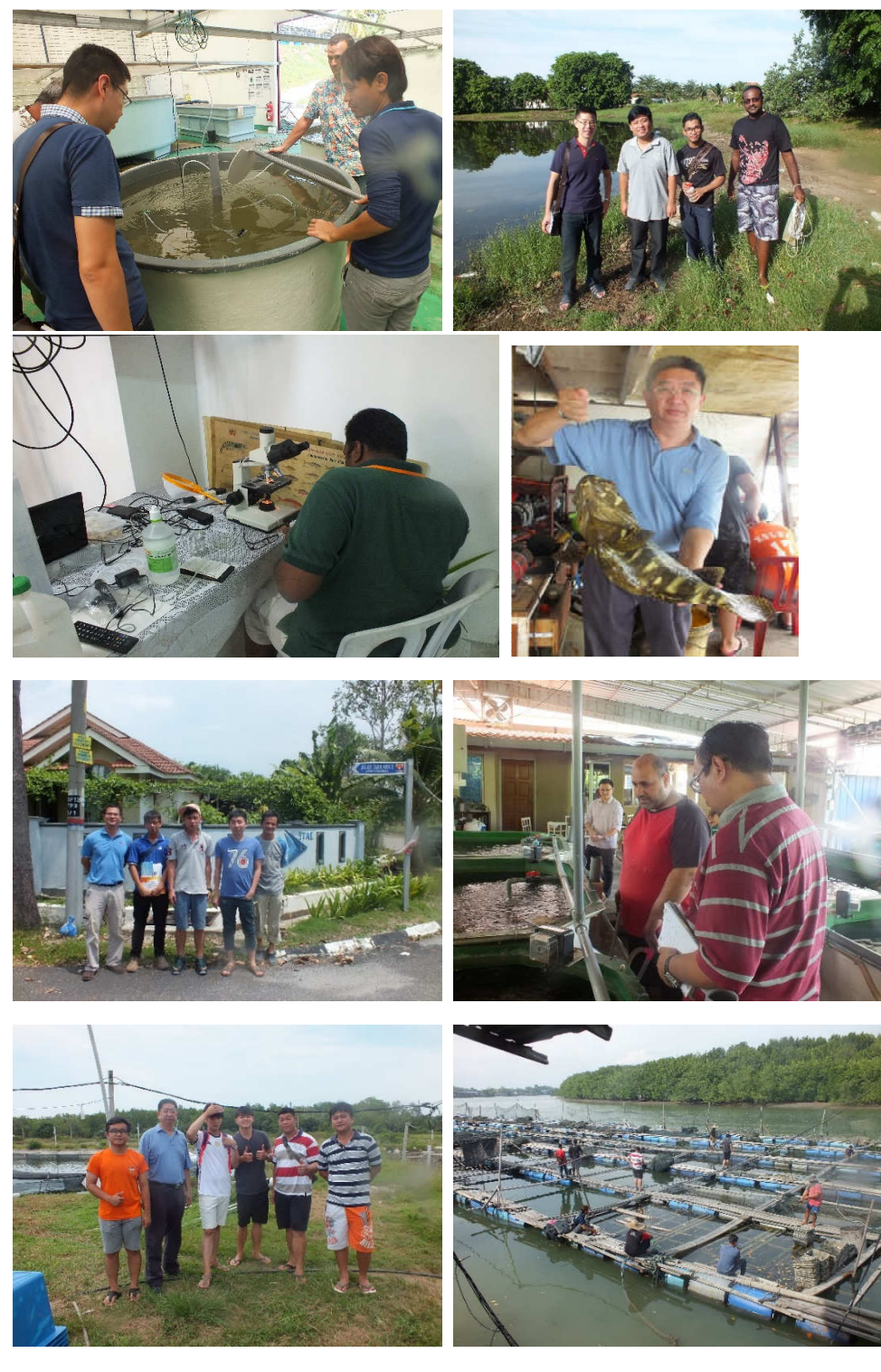
Farm and Hatchery Visits as study tour