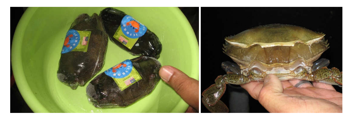
Soft Shell Crab and Molting of Crab