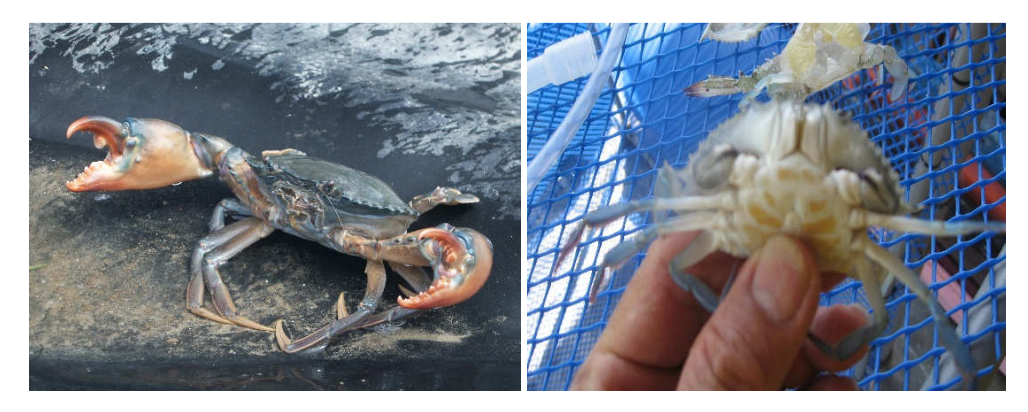
Mangrove(Scylla) crab and Blue Crab (Portunus)