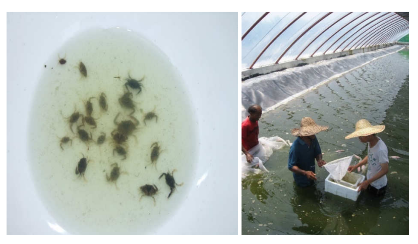
Mesocosm hatchery crab-let production

Marine Crab Farming and Breeding Cum Soft Shell Crab RAS Production