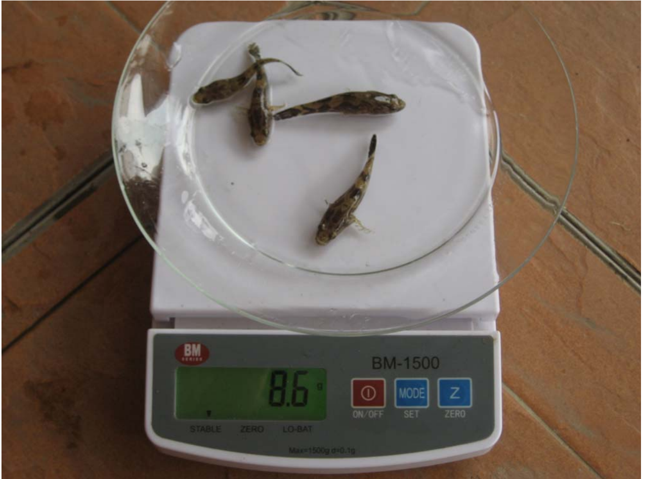
3 month-old Marble Goby fish fries ready for sale/stocking