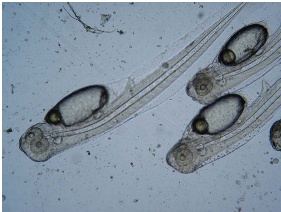
Day-old Marble Goby larvae