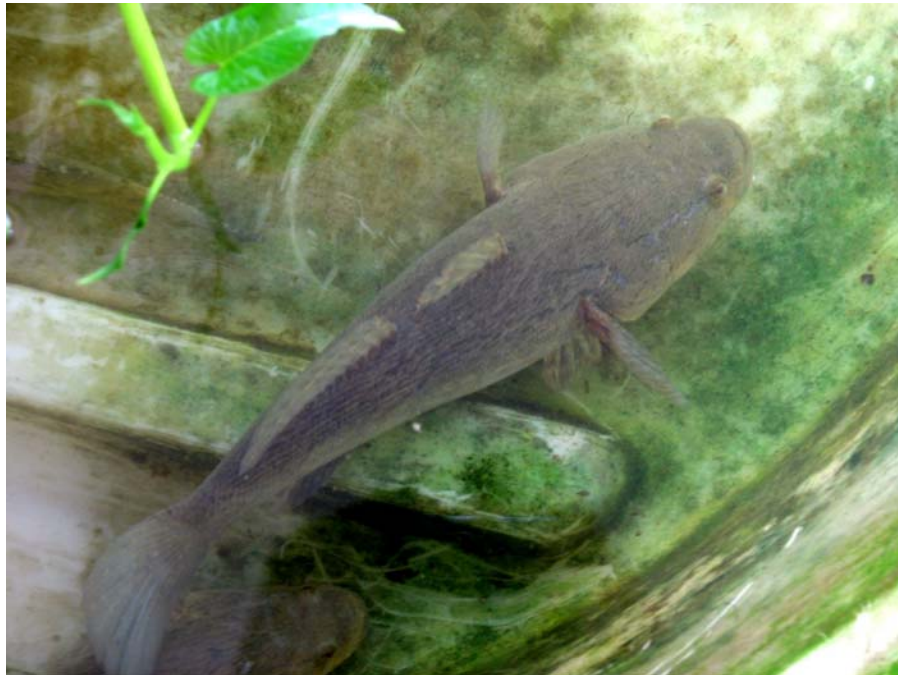
Adult Marble Goby