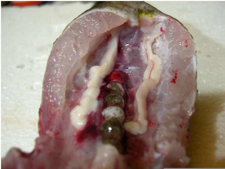
Mature testis of male Marble goby