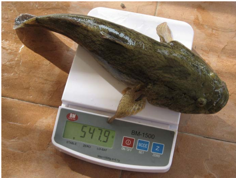
Adult Marble Goby