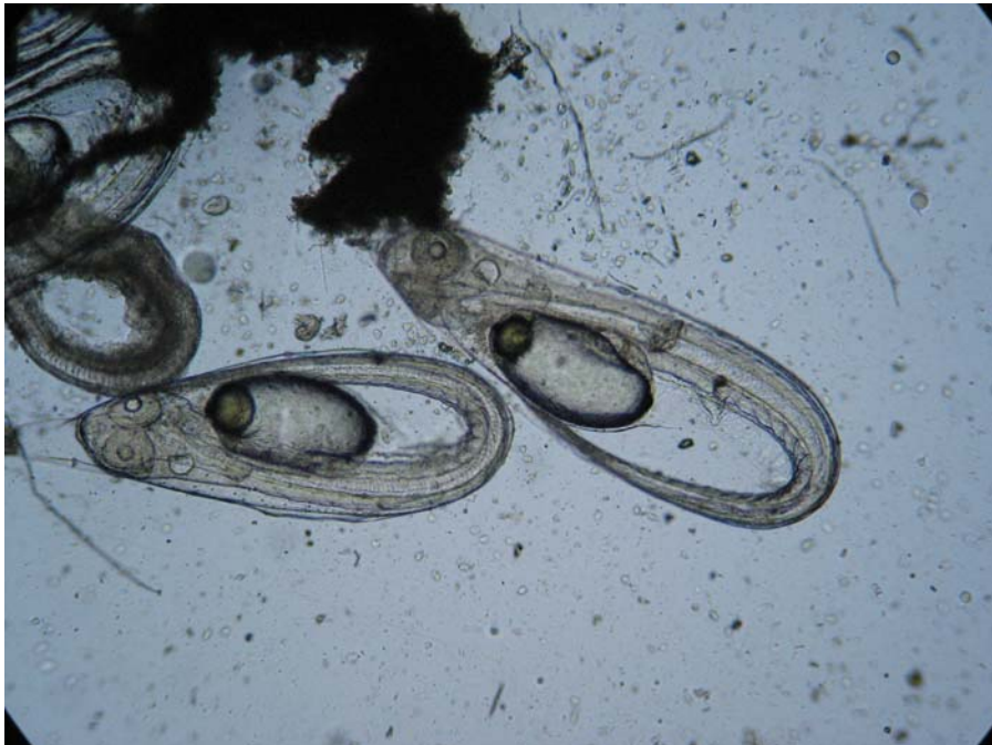
Development of embryo from fertilized eggs of Marble Goby seen under microscope