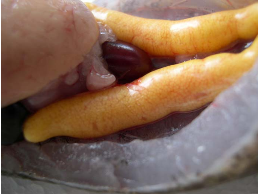
Dissection of Marble Goby-Ovary of mature female Marble Goby.