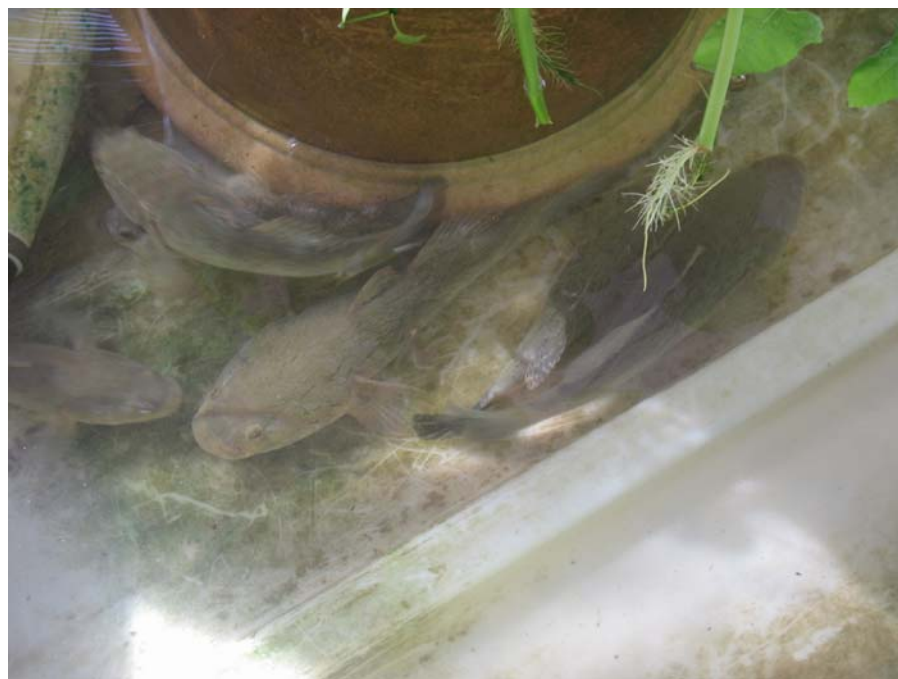
Raising Marble Goby in recycling tank