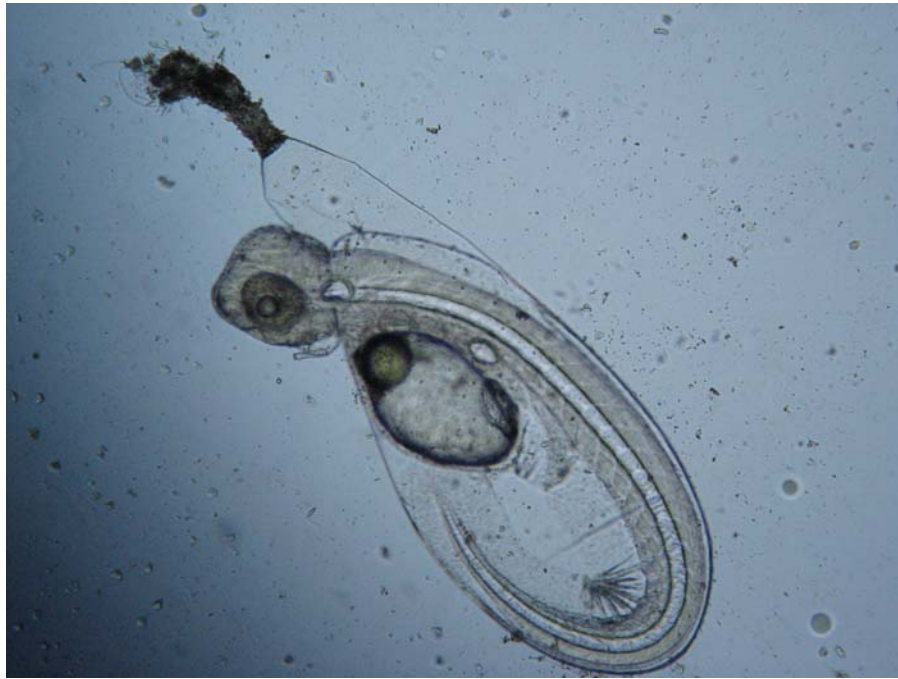
Hatching of Marble Goby egg (head of larvae emerged from egg)