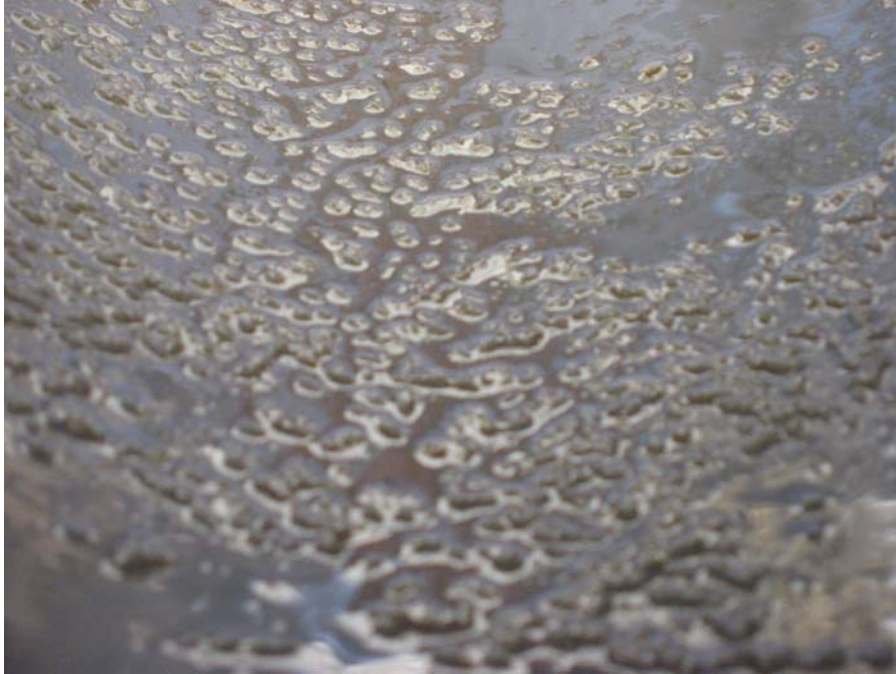
Fertilized eggs of Marble Goby deposited on PVC pipe