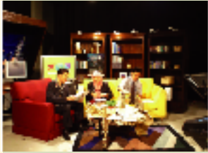
L A SOOSAYRAJ/MYCAT

In October, a case involving a snared and mutilated tiger made the local news. The culprit was apprehended but only received a small fine in penalty. MYCAT partners were interviewed by various media and the MYCAT Secretariat's Office