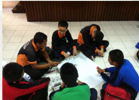
Group discussion among students on how to recycle used materials.