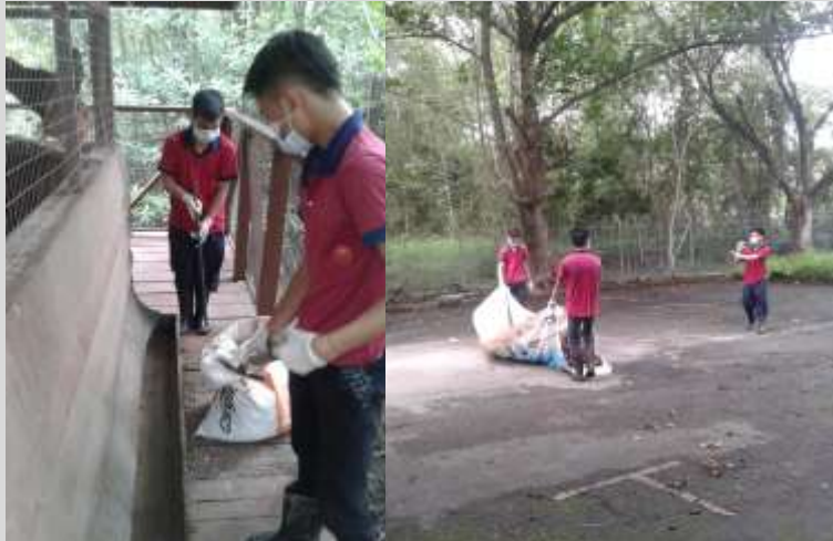
1 June 2017 SM All Saints Students (EVW): Cleaning Sentinel Flock and Making Compost