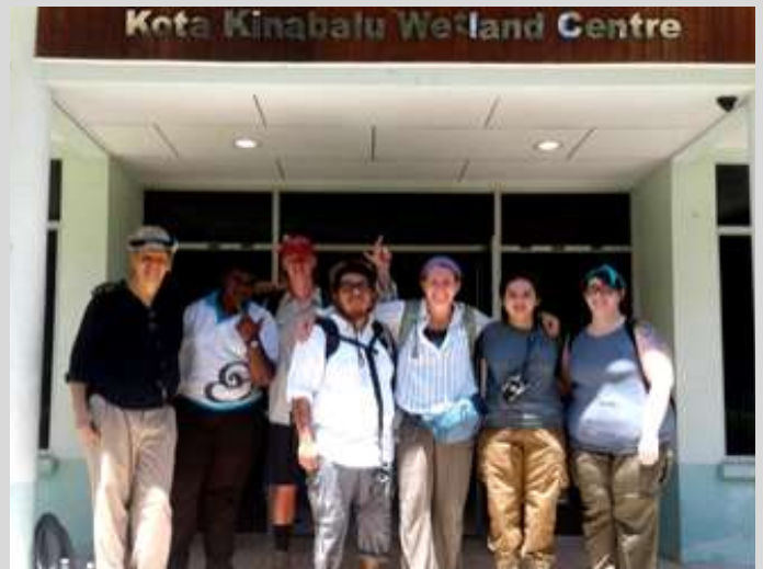
24 June 2017 Biology Degree Students & Lecturers, US (EE): Mangrove Interpretation