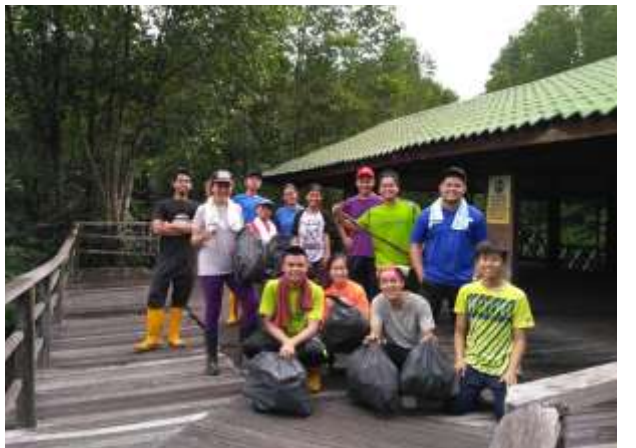
Mangrove cleaning activity by KK Bread of Life Apostolic Center (KKBOL)