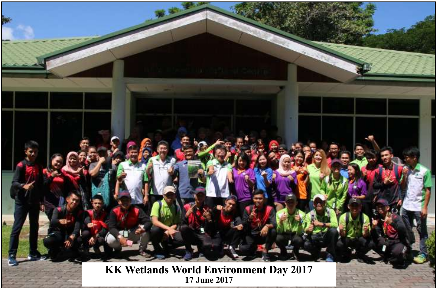
KK Wetlands World Environment Day 2017 17 June 2017