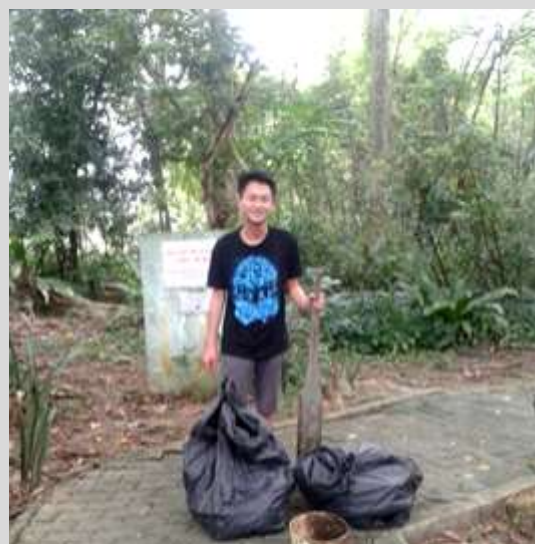
24 June 2017 Individual Volunteer (EVW): Cleaning the stream (rubbish collecting)