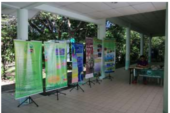
Information booth by Environmental Protection Department.