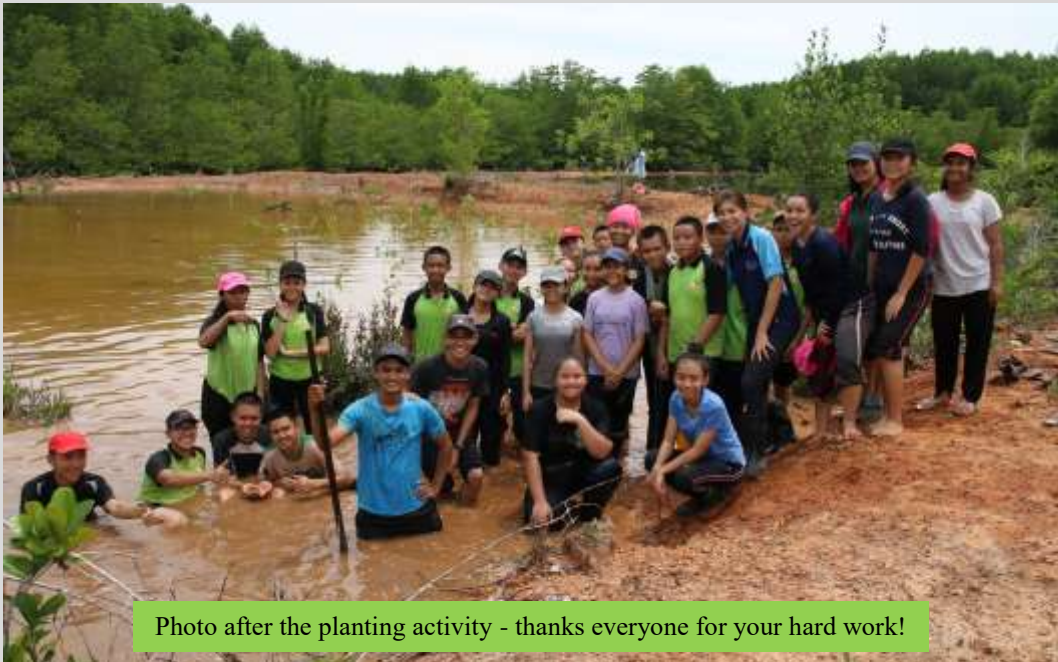
Photo after the planting activity - thanks everyone for your hard work!

Update! 1500 trees to be planted; 800 trees has been planted including 200 by this group. 500 trees to go!