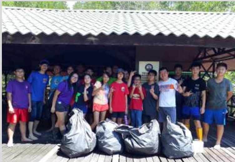
24 June 2017 SM Tshung Shin, Kota Kinabalu (EVW): Mangrove Cleaning