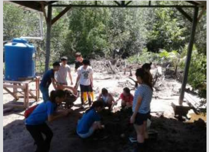
2 June 2017 UMS Rotaract Club & International Students (EVW): Nursery Work - preparing polybags for mangrove seedlings