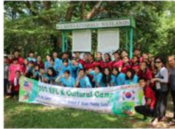
25 July, Environment Education Programme with SM All Saints & Bisan Middle School, Korea