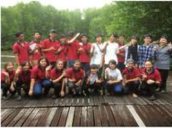
3 August, Environment Education Programme with SM All Saints & Japanese Student