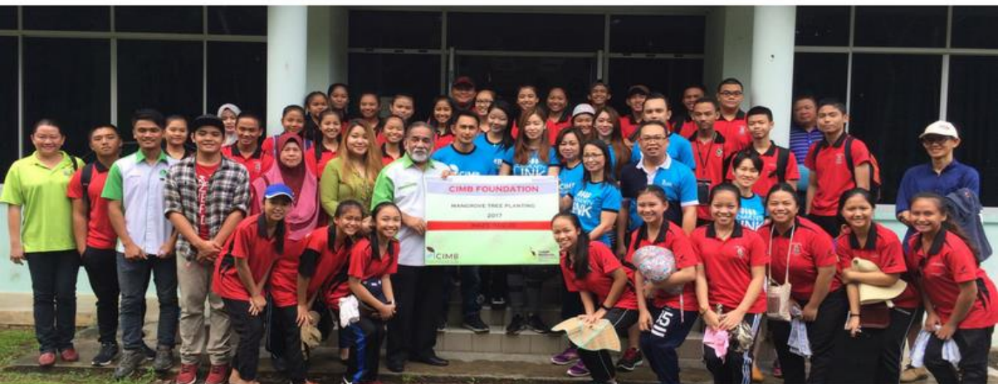
A group photo of SWCS with the CIMB Bank staffs and students