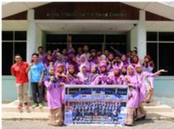
18 August, Environment Education Programme with SMK Desa Kencana, Lahad Datu