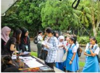
Registration of participants