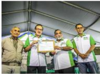
Ramsar certificate presentation