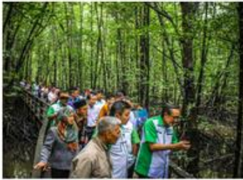
A walk through the mangroves