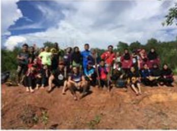
5 July, CIMB Mangrove Tree Planting with SK Pekan Kota Belud II