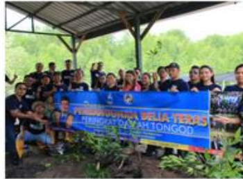
5 September, EEP and Mangrove Tree Planting with Pejabat Belia & Sukan Daerah Tongod