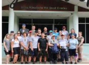
8 July, Environment Education Programme with UK Camp