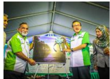
Coffee table book launching, Oasis in the City : Kota Kinabalu Wetland Ramsar Site