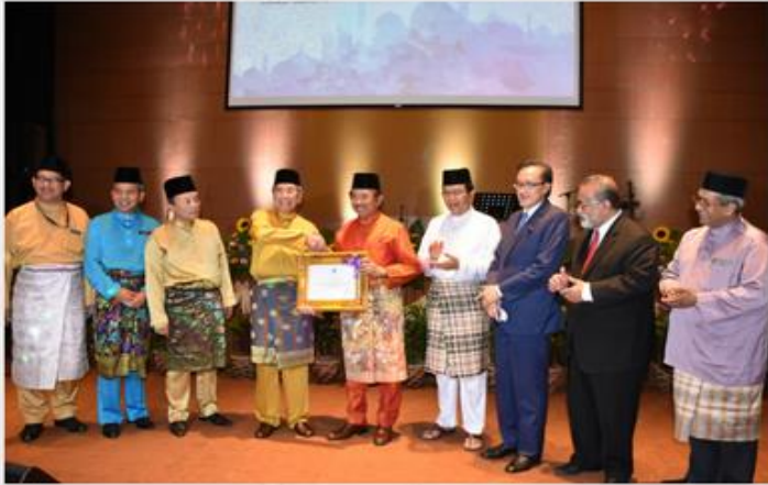
Presentation of Ramsar certificate, Putrajaya.