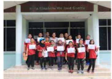
7 September, Environment Education Programme with SMK Bandau, Kota Marudu