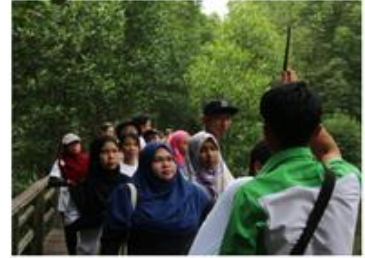
11 July, Environment Education Programme with Borneo Eco Warrior