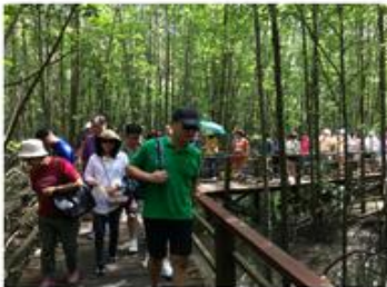
23 July, Environment Education Programme with Rotary Club Taiwan