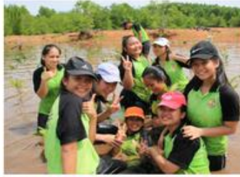
4 August, CIMB Mangrove Tree Planting with SM St. Michael Penampang