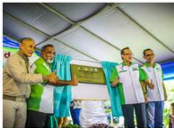
The unveiling of the Kota Kinabalu Wetland Ramsar Site plaque