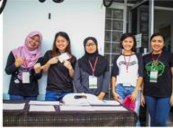
Our helpful volunteer