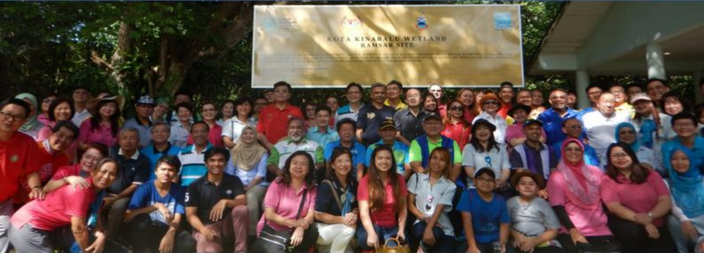
Group photo after Rotary Club Kota Kinabalu district Tree Planting Project at Kota Kinabalu Wetlands Ramsar Site