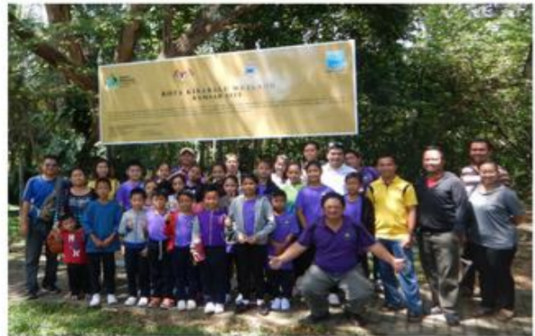
3rd November 2017, Environment & Education Programme with SK Monsok Tengah, Tambunan