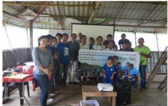
10th November 2017, Wetlands Conservation & Awareness Programme in collaboration with Acacia Forest Industries Sdn Bhd. SWCS has invited ANBATAR & one of the local community to give a talk on the importance of wetlands and wise use of mangrove.