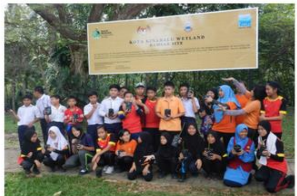
8th November 2017, Environment & Education Programme with SK Pekan Pitas II