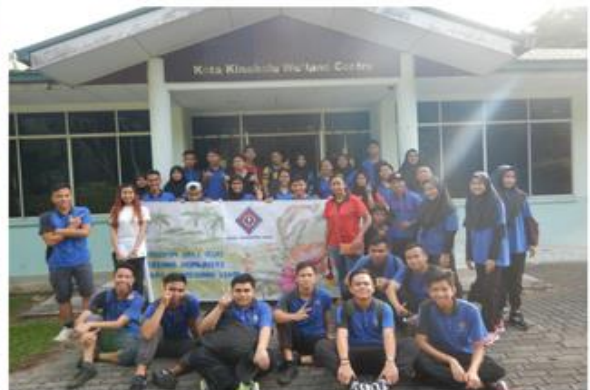
23rd November 2017, Environment & Voluntary Work with Kolej Vokasional Likas