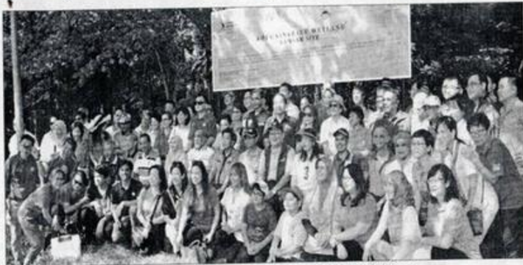
Group photo at the launching of the Tree Planting Project by RC KK Pearl.

Ten thousand trees are expected to be planted in the city area, Penampang, Putatan and Tuaran districts within the time