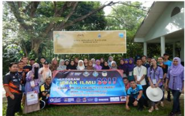
28 November, Environment and Education Programme with SMK Desa Kencana