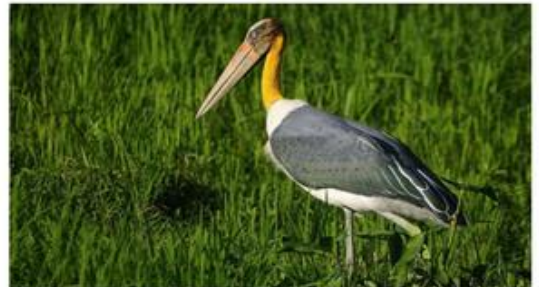
Lesser Adjutant Leptoptilos javanicus