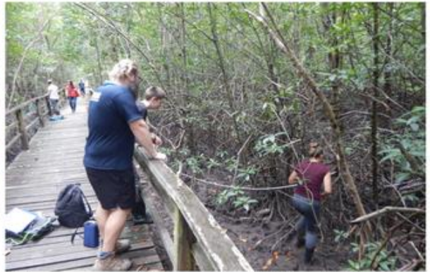
25th February 2018. Environmental Education Programme & Research with Kent Collage.