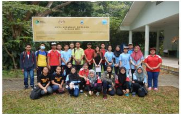
13th February 2018. Environmental Education Programme with SMK Lohan Ranau.