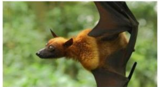
Flying Fox Pteropus vampyrus

This wetland has been identified as one of the important bird areas (IBA) of Malaysia. Pulau Kukup wetlands support some globally relevant species that has been listed in IUCN red-list and CITES, for example, Flying Fox Pteropus vampyrus which listed under CITES Appendix II, Long-tailed macaque Macaca fascicularis listed as vulnerable under IUCN red-list and Lesser Adjutant Leptoptilos javanicus listed as vulnerable under IUCN red-list.