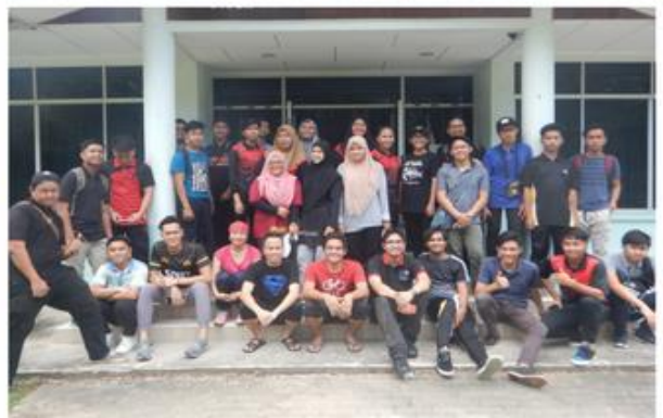
24th February 2018. Environmental Education Programme & Environmental Voluntary Work with Ecopolly Club, Politeknik Kota Kinabalu.