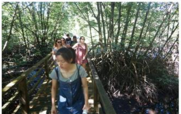
28th February 2018. Environmental Education Programme with Ludwig Maximillan University, Germany.