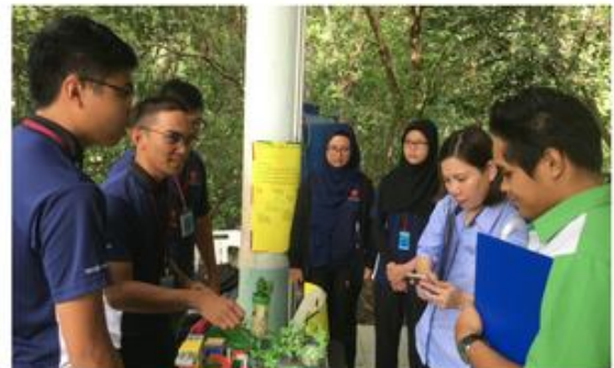
Students from SM All Saint Presented their Model Wetland

The team Totally Spies from SM St John Tuaran won this competition and received cash price RM500, followed by SM Maktab Sabah (RM300), and SMK Sri Nangka in the 3rd place received a cash price RM200. World Wetlands Day 2018 was made possible by the generous sponsorships from REMAJAYA SDN. BHD, REPSOL OIL & GAS MALAYSIA LIMITED and DBKK.