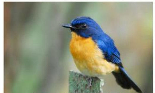
Mangrove Blue Flycatcher