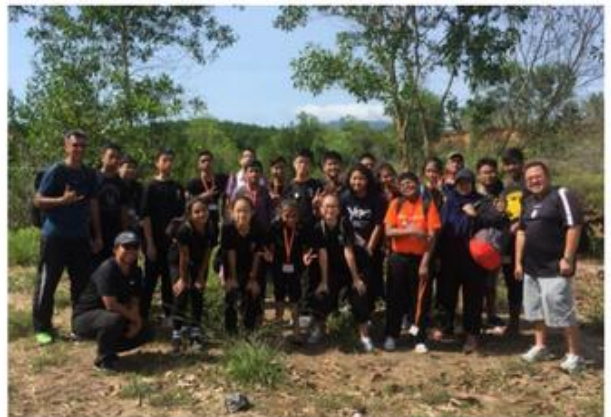
7th March 2018. Environmental Education Programme with Westwood Secondary School Singapore.