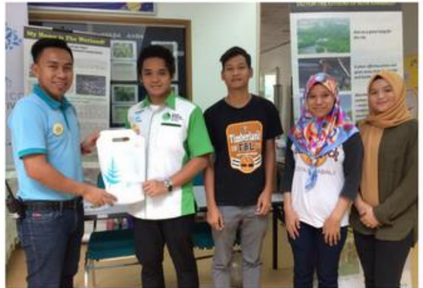
4th March 2018. Outreach, Petrosains Playsmart.