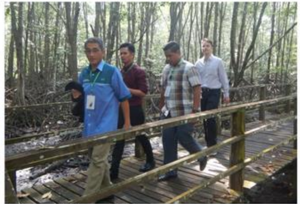
22th March 2018. Technical visit from IEM.