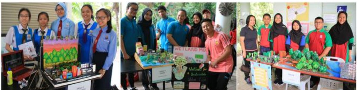
Winner Model Wetlands Competition (From left): 1st Place (SM St John Tauran) 2nd Place (Maktab Sabah) and 3rd place (SMK Sri Nangka)