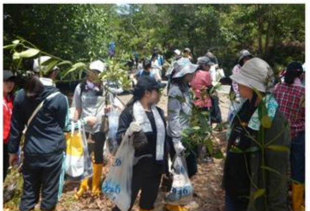
28th February 2018. Environmental Education Programme with Yamanashi Eiwa Highschool Japan