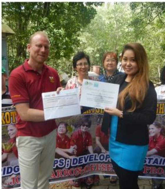
Swedish students raise RM7,000 for Mangrove conservation in Sabah