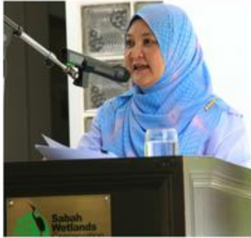
Speech from GOH YM Tunku Khalkausar

This year the theme for World Wetlands Day is "Wetlands For A Sustainable Urban Future" that invites people together to conserve and protect wetland areas around the world. Urban wetlands make cities liveable that improving urban air quality, reducing flooding, replenishing drinking water, filtering waste & improving water quality and promoting human well-being. Kota Kinabalu Wetland is the best example of urban wetlands because it is located strategically at the heart of Kota Kinabalu city.