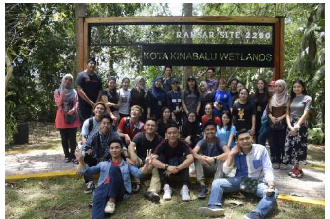
22nd March 2019. Environmental Education Programme with students from UCSF.