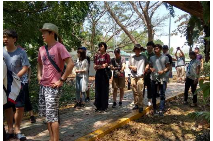
7th March 2019. Environmental Education Programme & Mangrove Tree Planting with SMI Holiday (Japan Group).