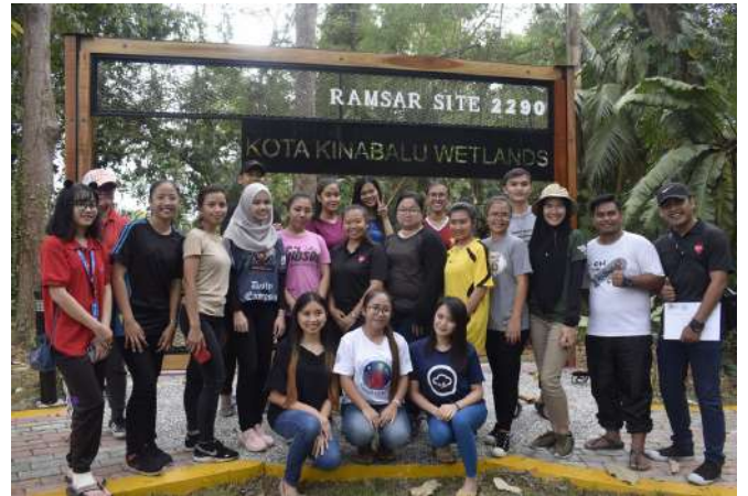
21st March 2019. RRCEA Project with students from Almacrest International College.