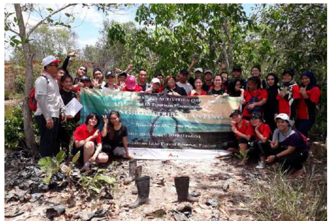
29th March 2019. Mangrove Tree Planting with students from Asian Tourism International College.