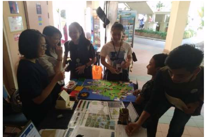
27th-28th March 2019. Outreach at Universiti Malaysia Sabah.