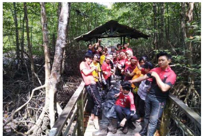
14th March 2019. RRCEA Project with students from Cosmopoint Kota Kinabalu.