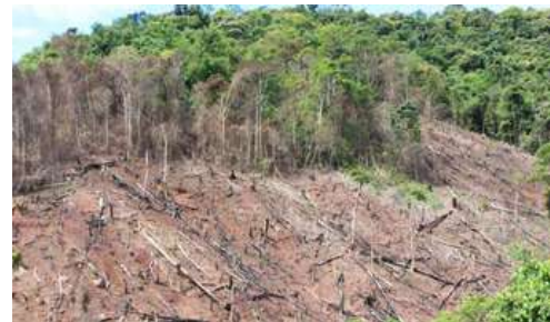
Deforestation

Recently there are few issues in Malaysia regarding the forests, as we know that forest plays an important role for the people and ecosystem. However, the forests are also suffering from the threat either by human or nature. In 2018, there is an issue regarding massive deforestation that happened in Gua Musang, Kelantan due to the Corporates wanting to convert the forest land to agriculture land. This clearing of forest land affects the river and the indigenous people. The indigenous people living in Gua Musang are having a hard time in finding non-timber forest products for their own use and to sell, not only that due to land clearing the river is also polluted because soil erosion makes it harder for them to get clean water supply.