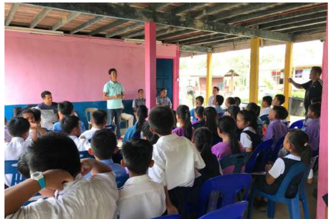
3rd March 2020. Outreach Programme (AFI Sdn Bhd) with SK Liu Pitas