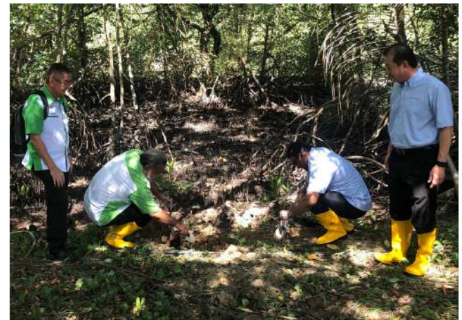
Symbolic Mangrove Tree Planting