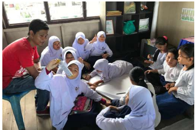
9th March 2020. Outreach Programme (AFI Sdn Bhd) with SK Telaga Pitas.