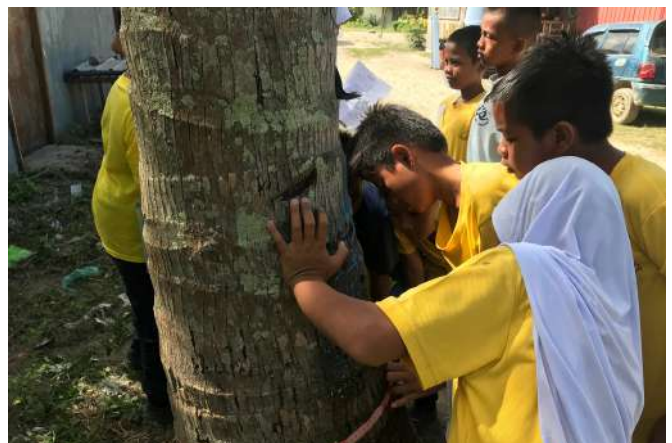
5th March 2020. Outreach Programme (AFI Sdn Bhd) with SK Malubang Pitas