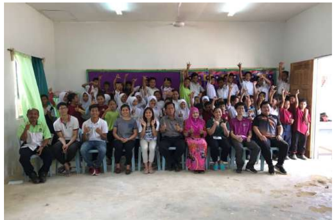
10th March 2020. Outreach Programme (AFI Sdn Bhd) with SK Datong Pitas