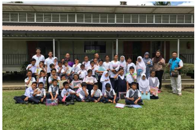
4th March 2020. Outreach Programme (AFI Sdn Bhd) with SK Bawing Pitas