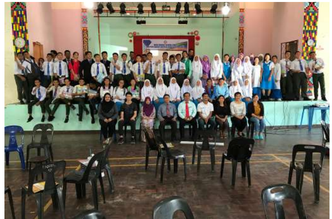
2nd March 2020. Outreach programme (AFI Sdn Bhd) with SMK Telaga Pitas