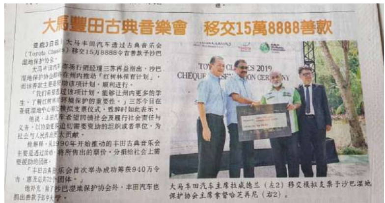
4th March 2020