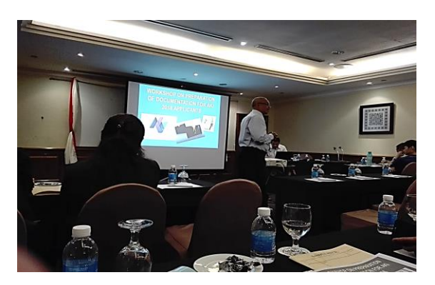
Photo taken during the workshop on "Bengkel Promosi dan Sesi Handholding Anugerah Kecemerlangan Industri (AKI), 2018"

Chairman, Sarawak Oil Palm Plantation Owners Association (SOPPOA)