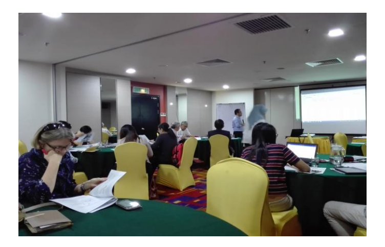
Discussion session for preparing the draft of Higher Conservation Value (HCV) Malaysia Toolkits.