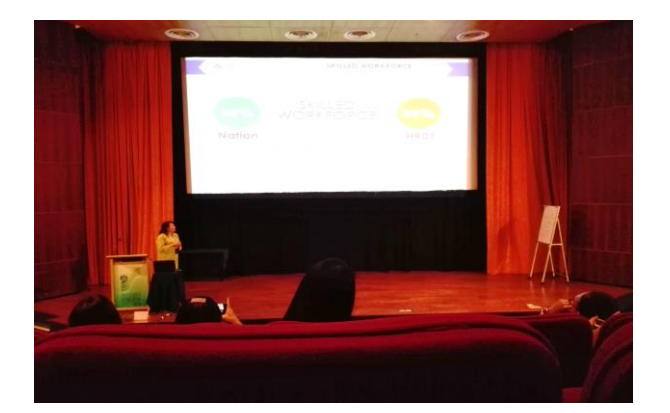
Photos taken during the workshop of International Labor Organization, 2017 at MPIC Putrajaya on 27<sup>th</sup> – 28<sup>th</sup> September 2018