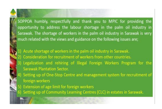
Photo on the left above taken before the discussion session and photo right was a slide presented during the discussion with the Ministry of Plantation Industries and Commodities (MPIC) at Bilik Mesyuarat Bahagian Penggalakkan Inovasi Modal Insan Industri, Aras 6, MPIC, Putrajaya on 17th November 2017 @ 10.30am.