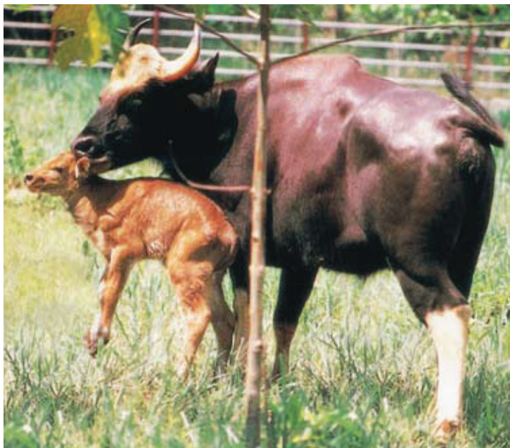
Cow and calf; the mother was one of three juvenile animals captured in 1992 and the baby was the first seladang to be born in captivity.