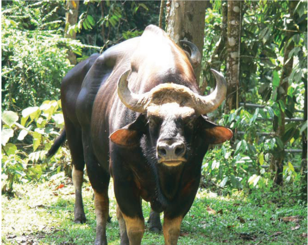
A dominant bull with a shy female behind it.

T he cattle family includes buffaloes, bisons and seladang. The seladang of the Malay Peninsular belongs to the same species, Bos gaurus , as the gaur of India. The natural range of Bos gaurus extends from India to Nepal, and across continental South East Asia, into tropical and sub-tropical China. The population in the Malay Peninsula is considered to constitute a