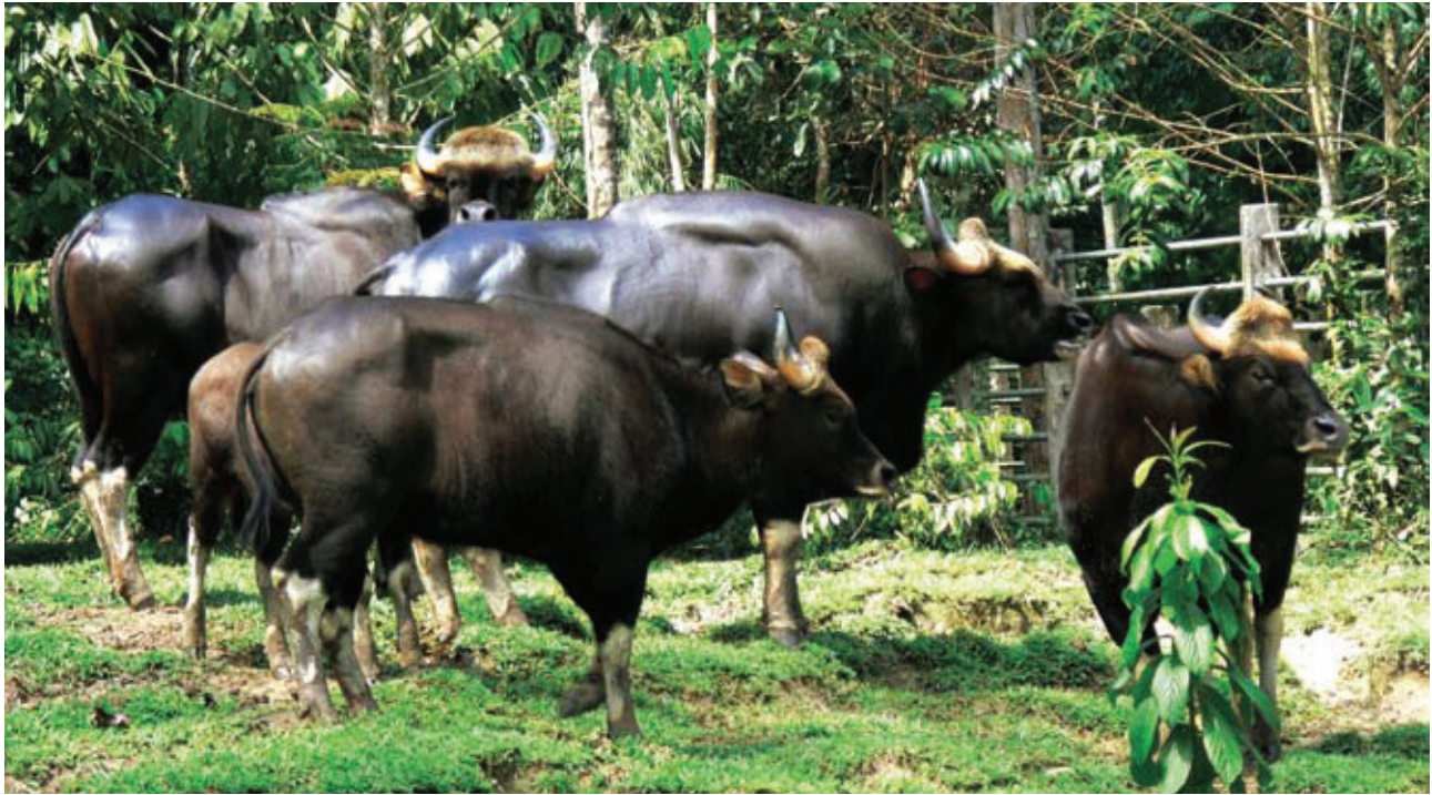
Seladang herd in NWRC, Sungkai.

But it is in the massive girth and shapely curve of the horns that the great beauty of the seladang lies. At their base, the base of an old bull's horns are deeply annulated and indentated, and covered with many scars and rugged pits that would seem to tell of much battering. The horns sweep out boldly from the brow, curving in again at their extremities; and in a most beautiful head, belonging to the first seladang that I shot, the distance between the points is exactly the same as the distance between the eyes—thirteen inches. These horns measure six feet and a few inches from tip to tip along the outer curve and across the forehead, and their circumference at the base is nineteen inches. But on the living animal the head looks small in proportion to the gigantic bulk of the body. It is the relatively small head and extraordinarily small hooves that give the seladang an appearance of high breeding, which goes far to make it so noble-