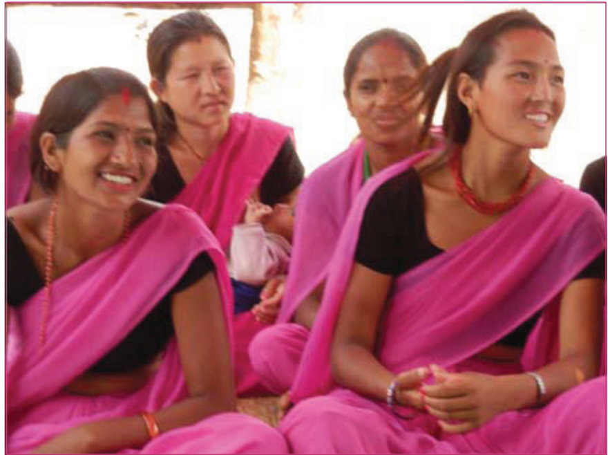
Farmers attending a training session in animal husbandry in the hilly areas of Chulidanda in Nepal

In a previous issue of this journal (Vol.1, No.4, 2015), attention was drawn to the importance and potential of small farm systems in food production. Emphasis was placed on the complexities of farming systems in small farms due to the numerous interactions of the sub-sectors and the need to resolve major constraints. The poor live in a non-ending syndrome of poverty – adaptation – fragile lives – little hope – low life expectancy , in which human dignity is at stake (Devendra 2007, 2010) but