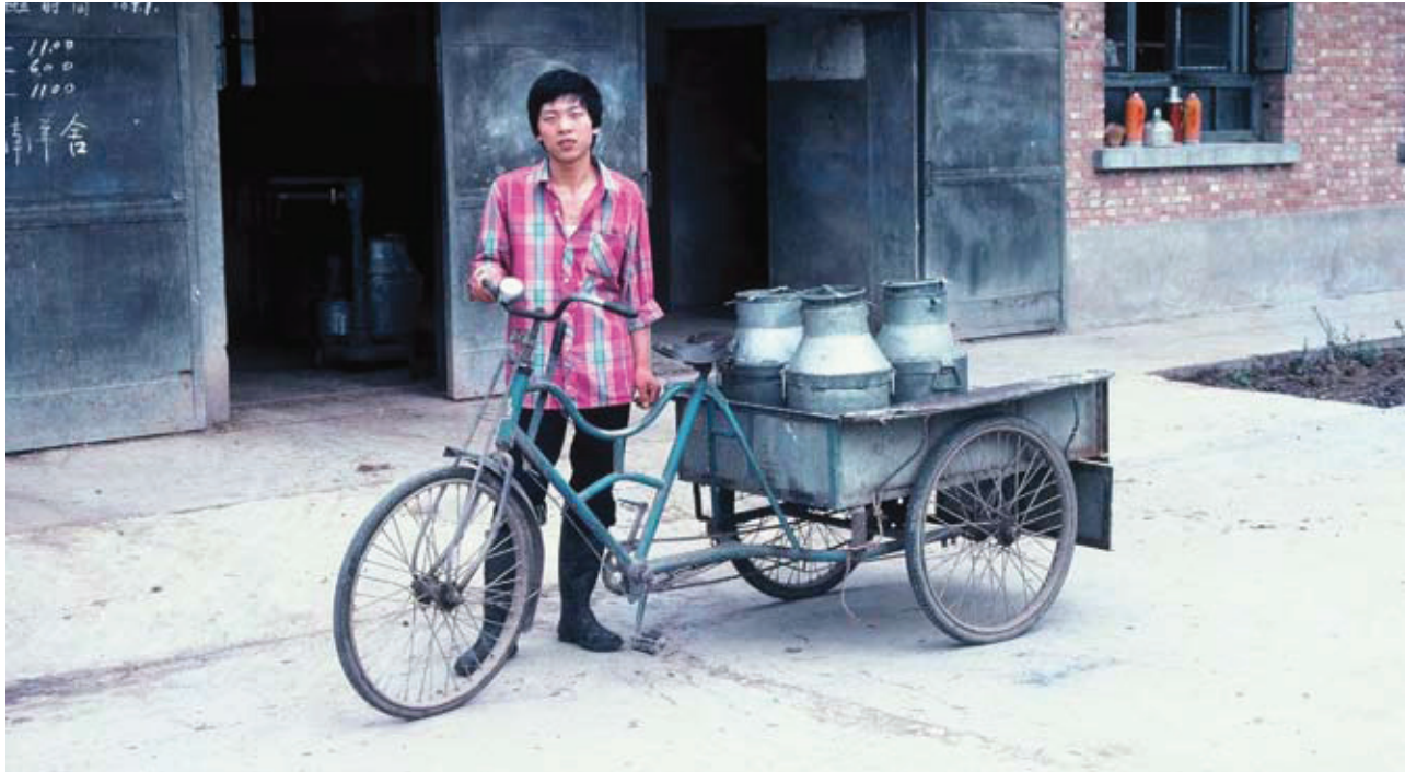
Marketing and delivery of milk at the village level in Xian Province, China.

and peace.” The International Food Policy Research Institute IPFRI (2015) has just completed a policy seminar that examines how gender research and its application to policy issues have changed the landscape of food policy and agricultural development programming. Among the key observations are these two: