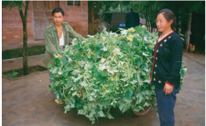
Farmers with harvested virus-free sweet potato vines to feed ruminants and pigs in Sichuan Province, China.

Non-formal education and training are becoming increasingly important, and are conducted at several levels in colleges, universities and government institutions as well as in rural areas at provincial, district, sub-district and farm levels. The rationale and justification for such efforts are determined by prevailing circumstances and urgent or particular needs and constraints.