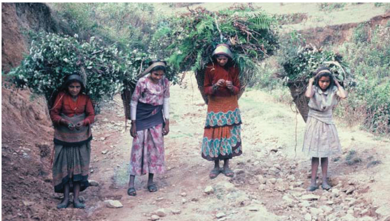
Girls homeward bound after walking 2-4 km to harvest tree leaves to feed their ruminants in the mid-hills of Nepal.

from 11 such women, two years after each had been provided with an initial investment of a doe costing about USD11. Also in Bangladesh, monitoring studies over years on 40 women who had received micro credits over 10 years indicated that 40–60% of the first loans are invested in animal enterprises. These women had developed successful enterprises from small animals into larger and more sophisticated schemes such as dairy production.