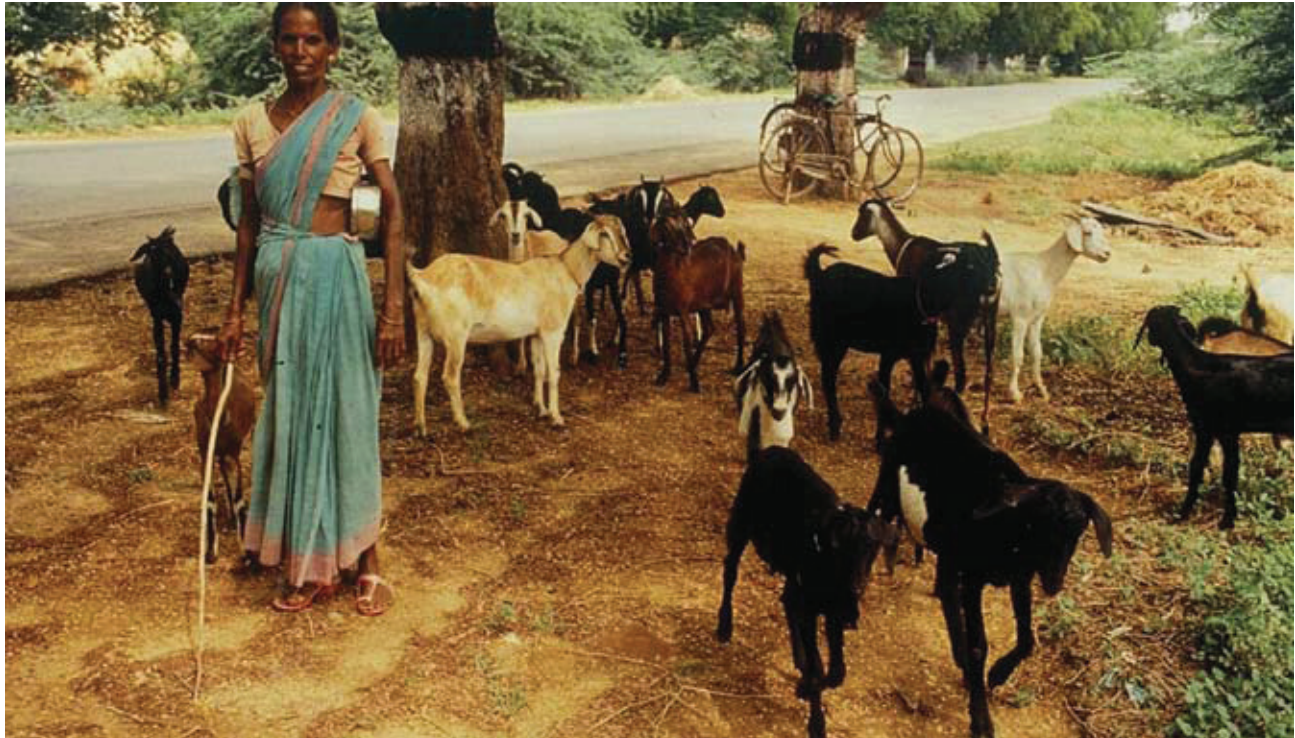
Farmer and her flock of goats in extensive grazing in search of feeds and water in Andhra Pradesh, India. Wayside grazing over 6-10 km is common and includes lopping of tree leaves to meet the feed requirements.

farm income enables diversification of income throughout the year and reduces seasonal risks. Non-farm income as a share of total income averages approximately 32% in Asia, 40% in Latin America, and 42% in Africa (Haggblade et al. , 2005). Policy makers view the non-farm economy as an important contributor to poverty reduction.