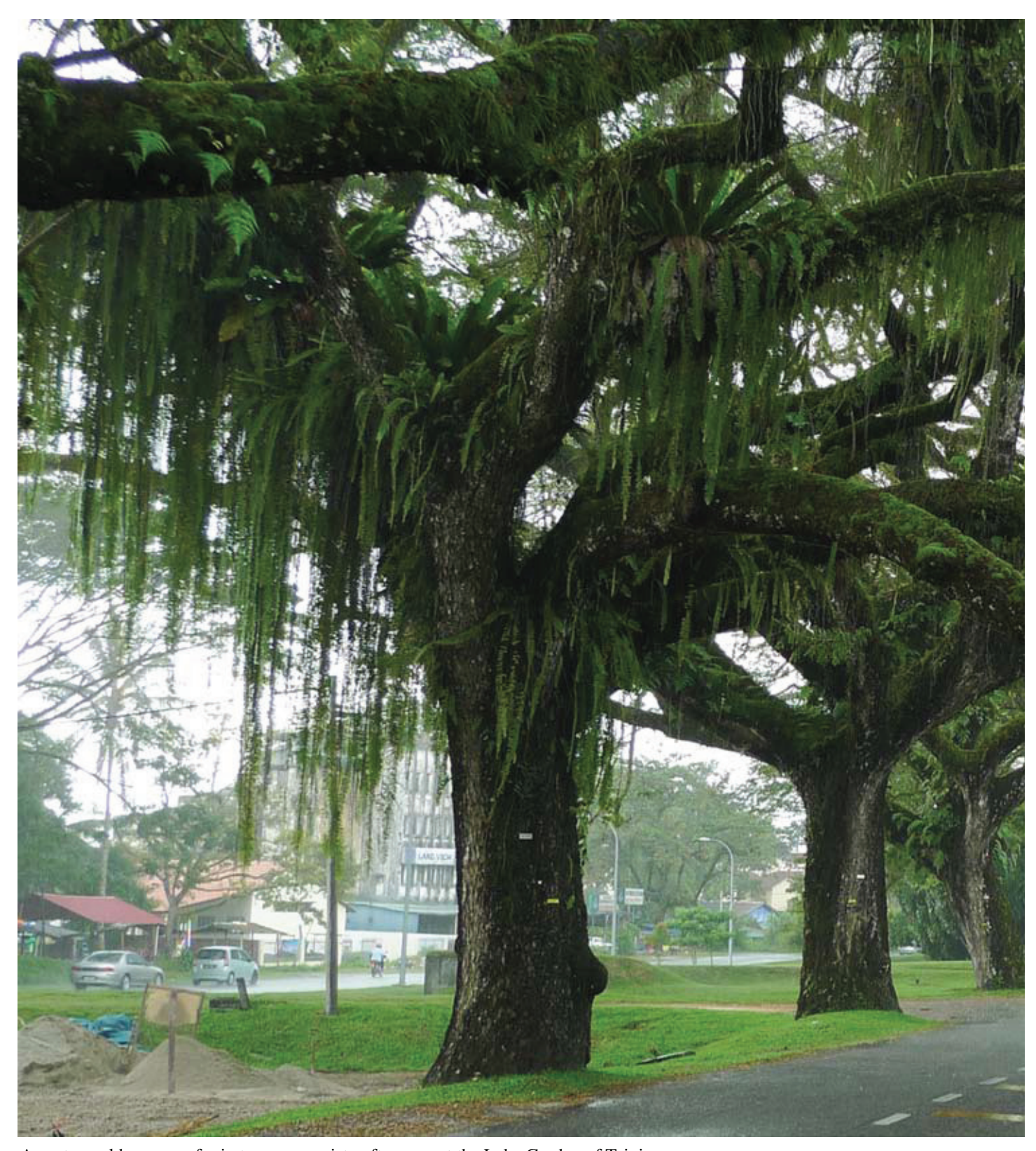
A century-old avenue of rain trees on a misty afternoon at the Lake Garden of Taiping