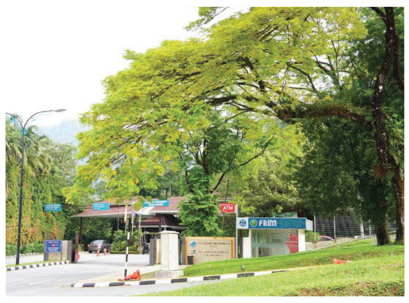
A 31-year-old yellow rain tree, at the entrance of the Forest Research Institute Malaysia (FRIM) in 2015, grown from a seed germinated in 1983–1984

January 1984. The first batch, of 815 seeds, produced 625 seedlings with green cotyledons and 189 with yellow cotyledons. The second batch, of 320 seeds, yielded 246 seedlings with green cotyledons and 74 yellow. In both cases the ratio of green to yellow was 3.3:1. The ratio was very close to 3:1, which anybody who has studied elementary genetics would recognize one of the famous Mendelian ratios.