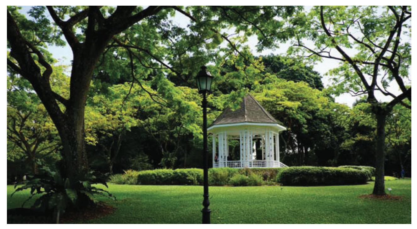
Yellow rain trees around the Band Stand in the Botanic Gardens, Singapore

The rain tree, Samanea saman (also known as Pithecellobium saman ) is the best-known tropical tree in the world. Visitors arriving in Singapore's Changi Airport see them as impressive umbrellashaped trees lining the road into the city. In the Philippines this is the 'monkey pod' often used for carved souvenir items. In Hawaii, the rain tree and the coconut are grown to emphasize the image of Hawaii as a tropical resort.