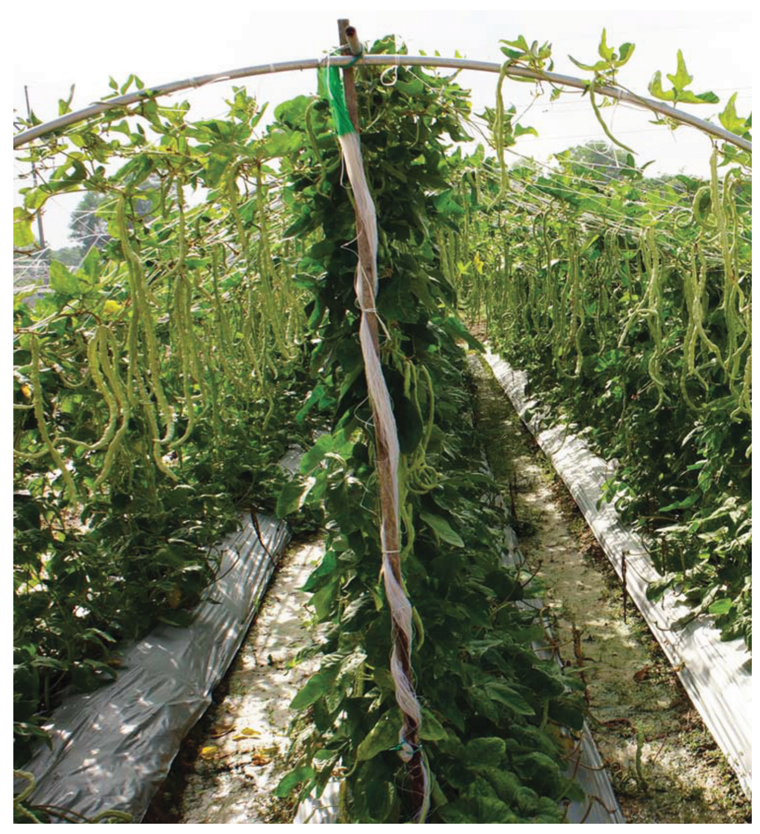
Long beans grown for seed production