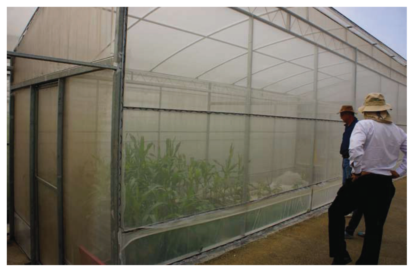
Quarantine house, for study of disease resistance

produce are not optimised for the tropics. The reasons for the lack of a plant breeding and seed industry in Malaysia have been outlined in a paper by Wan Jusoh Wan Mahmood of MARDI in 2006. The main reasons are institutional weaknesses and lack of a reliable dry season