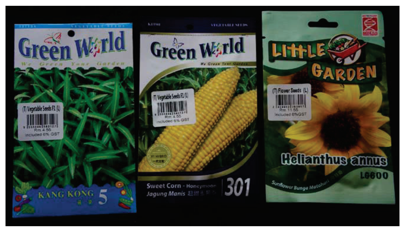
Seeds for home gardens marketed under the Little Garden label of GWG and the Green World label of Leckat Corporation, a subsidiary of GWG