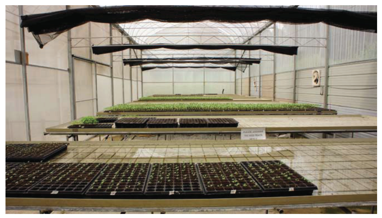
Seed germination house, with bottom irrigation of germination trays

the students learn not only how to grow crops but also how to manage a farm and supervise workers. The interns are selected by GWG from candidates proposed by the universities. GWG looks for candidates who are genuinely interested in hands-on farming. At UPM the 6-month internship comes at the end of their four-year degree course. GWG's target is to train 150 growers in 2015, and initiate 70 contract farms in Malaysia supported by the Malaysian Government's Economic Transformation Programme (ETP). The ETP covers 12 National Key Economic Areas (NKEAs) one of which is agriculture. Under the NKEAs, a total of 149 'Entry Point Projects' (EPPs) have been selected. Seed industry development is EPP 14. GWG has been appointed under the Economic Transformation Programme (ETP) of the Malaysian Government as the anchor company