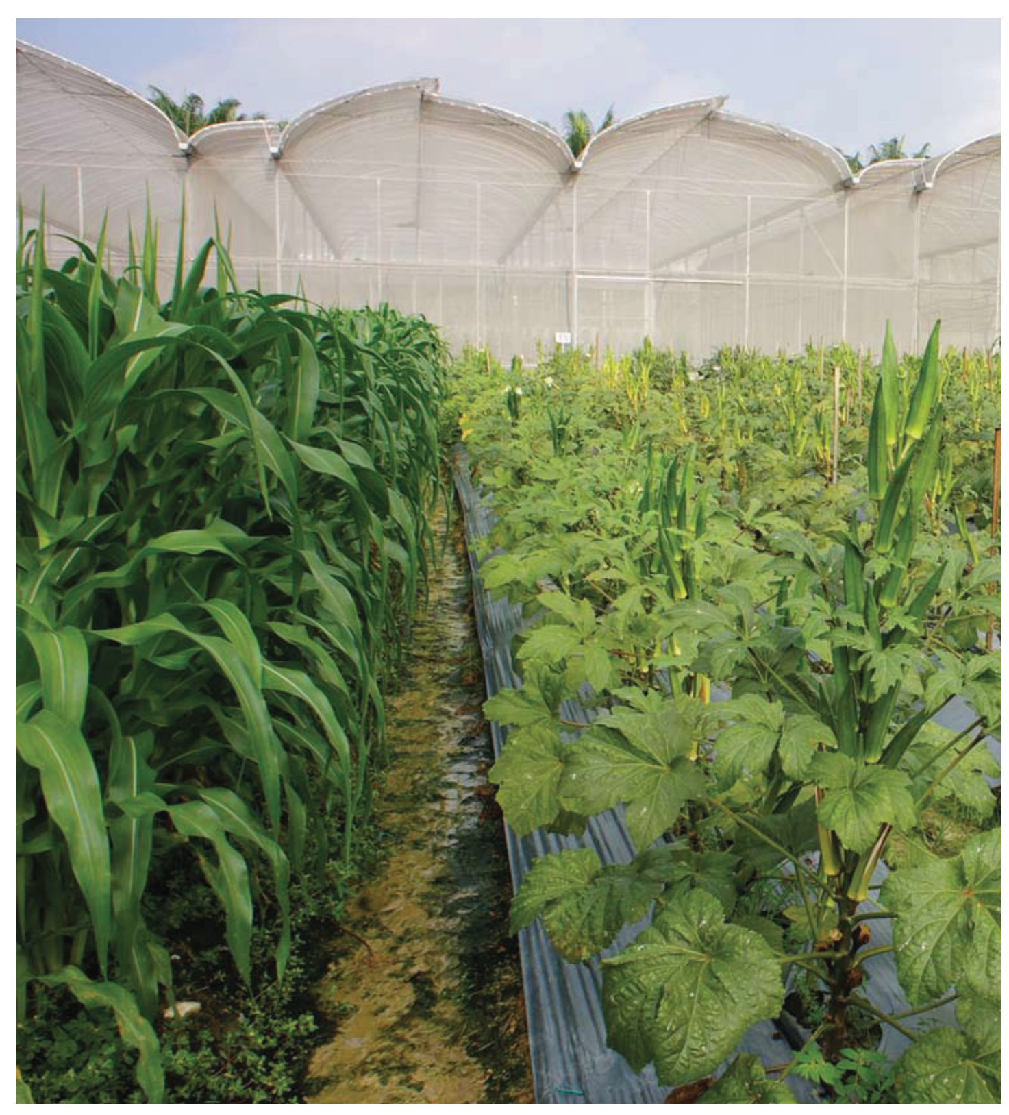
Ladies fingers grown for seed production; note the plant houses at the back