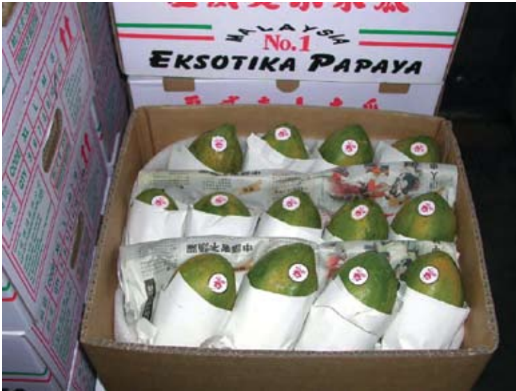
Eksotika packed for export market