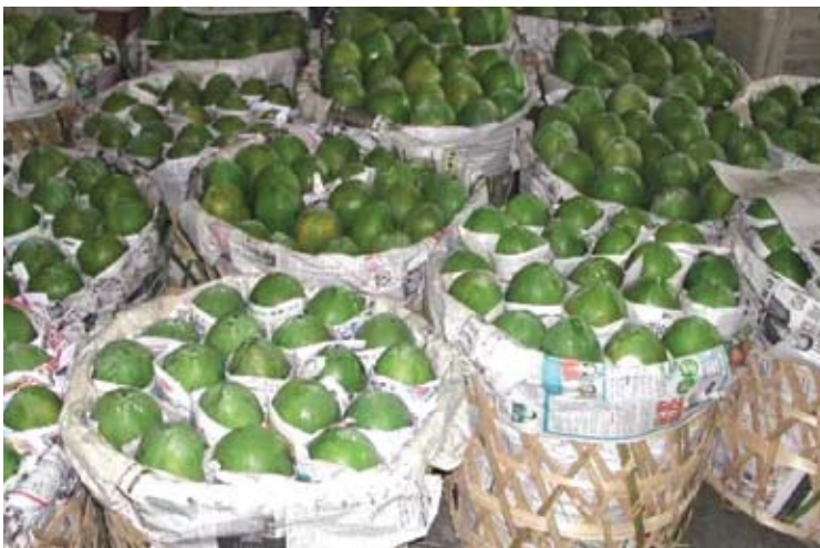
Sekaki packed for the local market