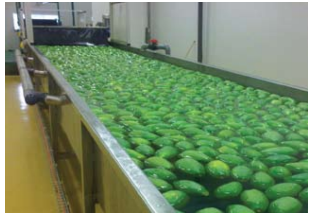
Papayas cleaned for export