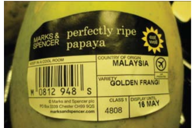
Malaysian papaya at Marks & Spencer