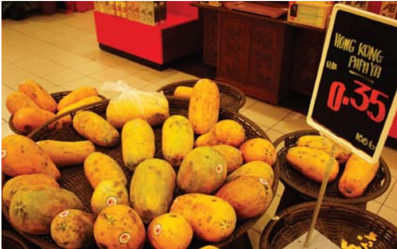
Ungraded Sekaki fruits labelled as "Hong Kong"