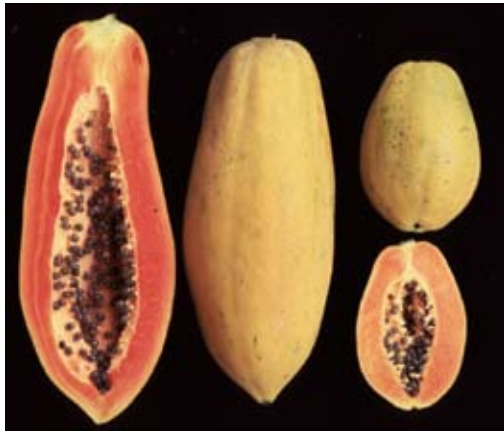
Subang (left) compared with the Sunrise Solo (right) in the backcross breeding programme