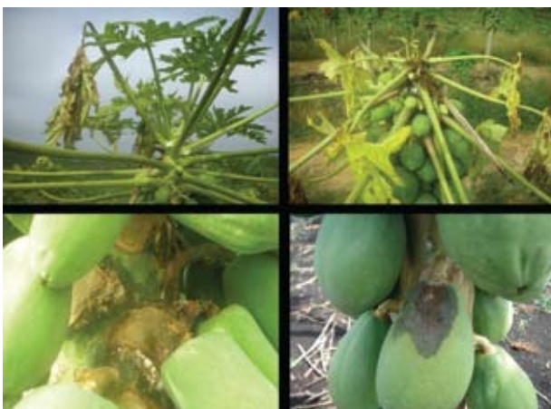
Bacterial dieback disease symptoms

Another possibility is to select plants for resistance to the disease, 19 different accessions 4 have been screened and one accession has been found to have remarkable resistance. Further research and development of resistance may enable the industry to recover its former glory. However there is a possibility, as with all severe contagious diseases, for the disease to die out by itself after it runs out of susceptible hosts.