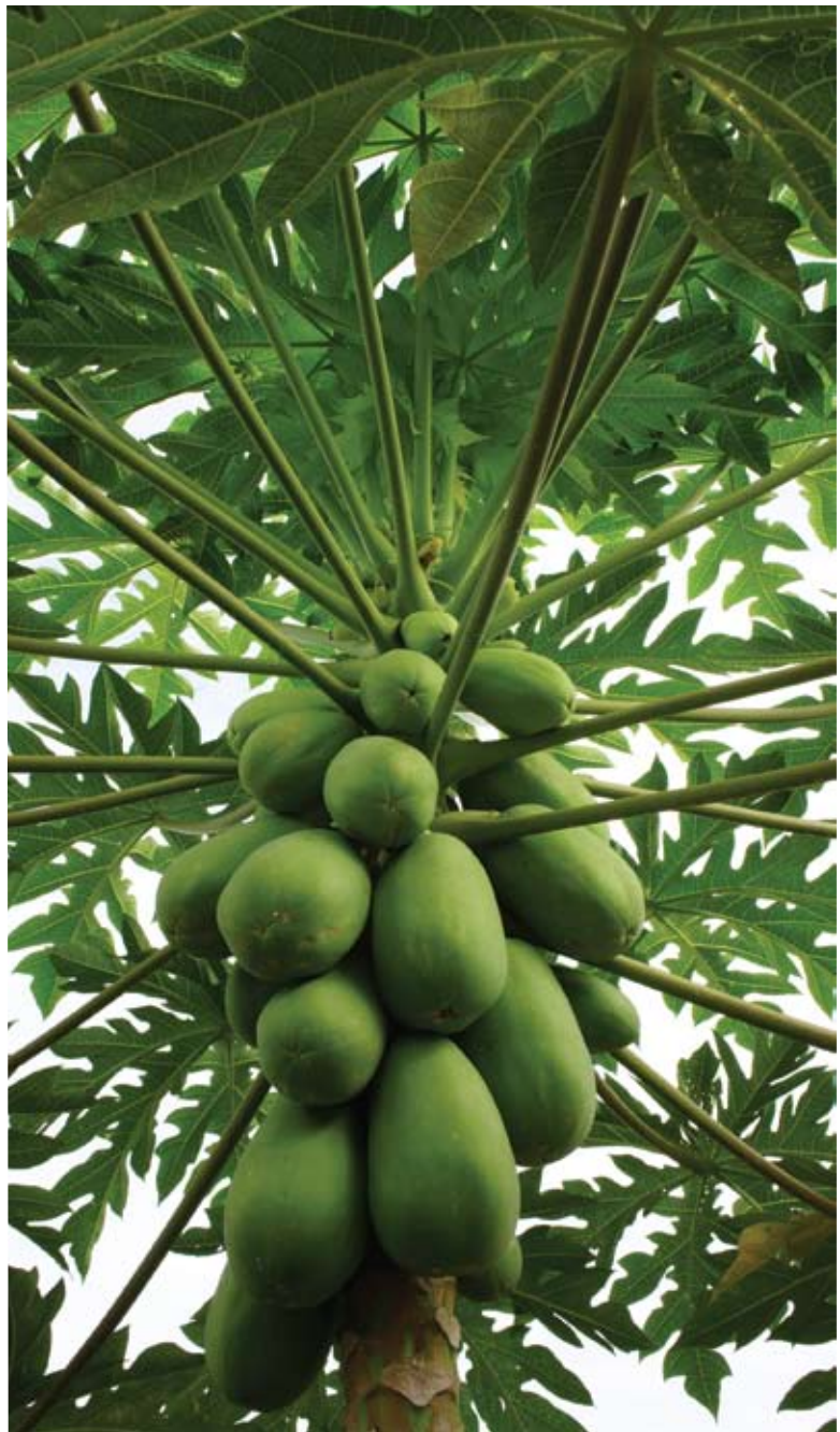
Fruiting hermaphrodite tree of the Sekaki variety

The early Spanish explorers in tropical America found the papaya as a cultivated plant. Truly wild papayas were not detected until recently when wild populations were found in the Caribbean coastal lowlands of Southern Mexico and Northern Honduras (OECD). The wild plants are either male or female, and the female plants produce bitter-tasting fruits the size of golf balls, filled with small seeds.