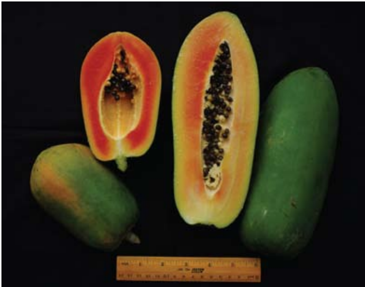
Fruits of Sekaki variety : L—female; R—hermaphrodite. "Sekaki" as a fruit name should only be applied to the hermaphrodite.

Hermaphrodite trees were not mentioned by Linshoten, who noted that the trees were separately male and female, and the female alone