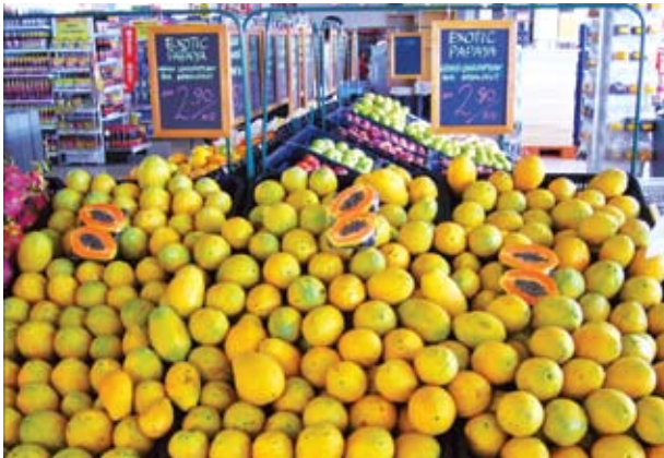
Ekstotika in a supermarket