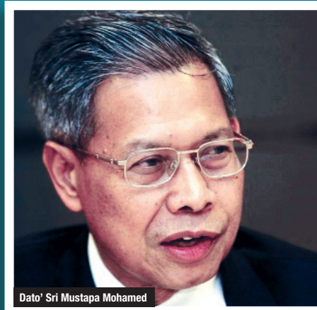
Dato' Sri Mustapa Mohamed