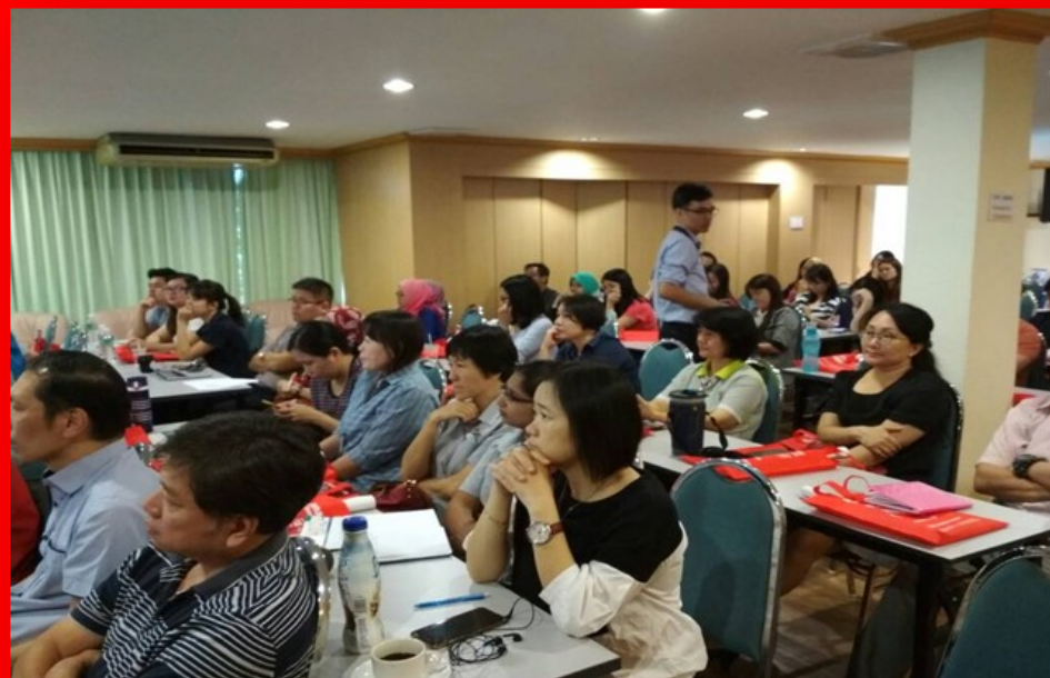
Members of the Muar Furniture Association at the briefing on ACA in December 2017

The second category caters for other industries where an automation capital allowance of 200% will be provided on the first RM2 million expenditure incurred within five years of assessment from 2015 to 2020. While the number of applications for the incentive was slow in the beginning, it has been increasing as industries are becoming more aware of its existence and attractiveness. To date, MIDA has received more than 100 applications.