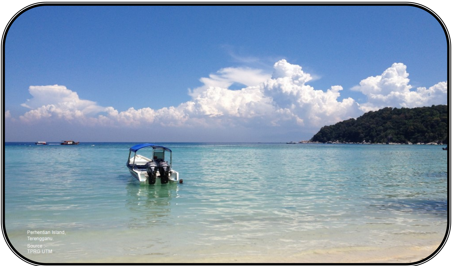
Perhentian Island, Terengganu.

Tourism has traditionally been a significant sector in Malaysia, being the third largest contributor to the nation's economy. According to the Ministry of Tourism and Culture Malaysia (MOTAC), in 2016, the tourism industry contributed 14.8%, amounting to RM182.4 billion to Malaysia's GDP. As luxury travelling becomes more affordable and popular holiday destinations are increasingly overcrowded, travellers are seeking for locations which offer unique experiences and are comparatively preserved. Tapping into these preferences, the Malaysian Government has targeted ecotourism as a key segment to be developed within the tourism industry.